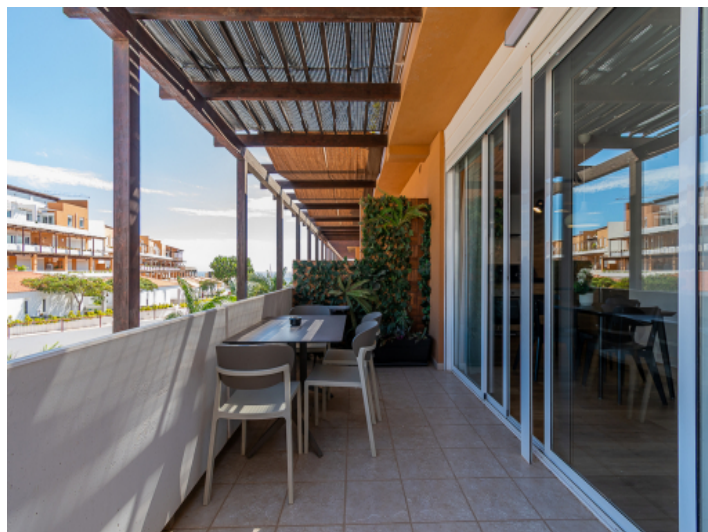
Terrace with outdoor dining area