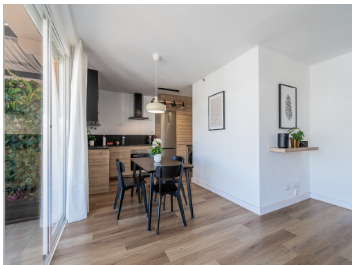
Dining area adjacent to the kitchen