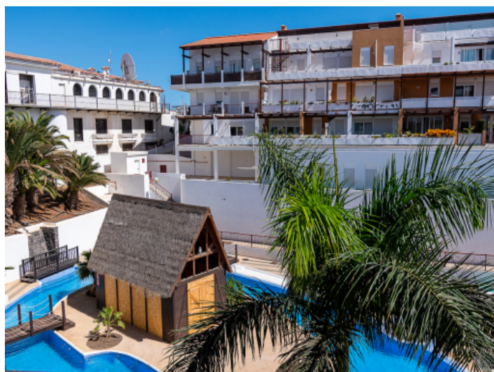
Superb communal pool