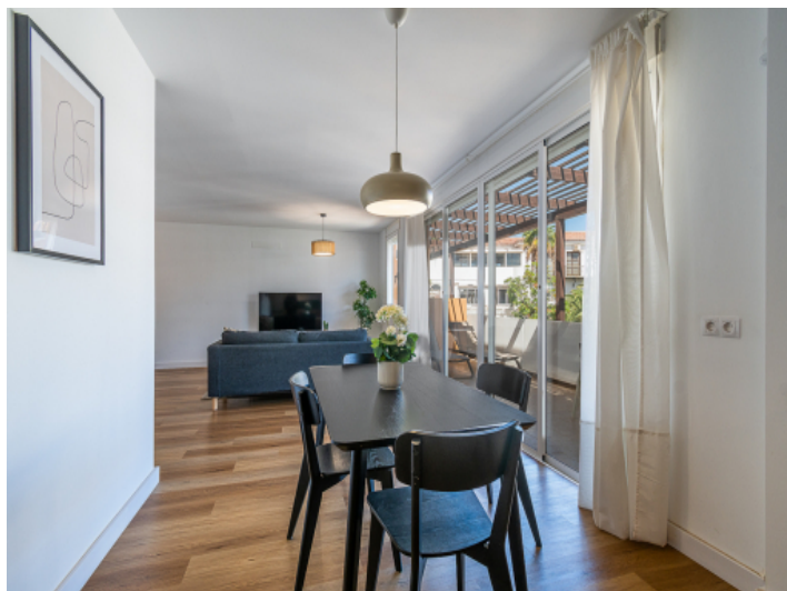
Bright dining area