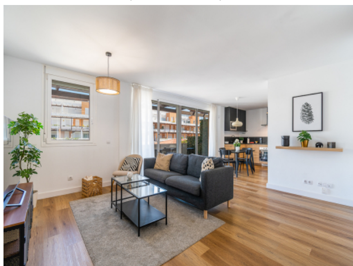
Elegant living area