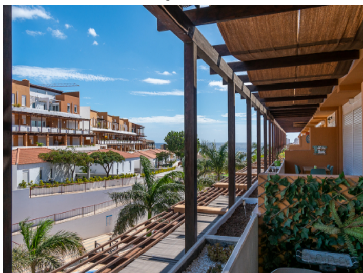
Partial sea views