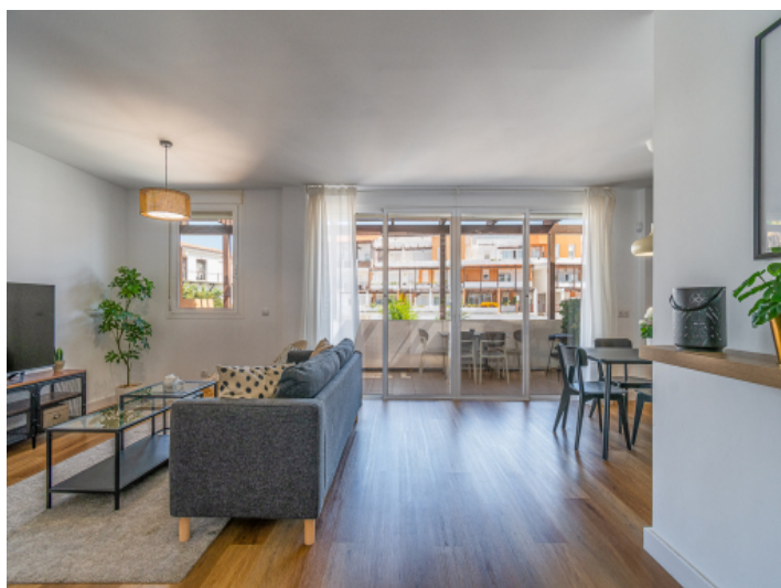
Living area with access to the terrace