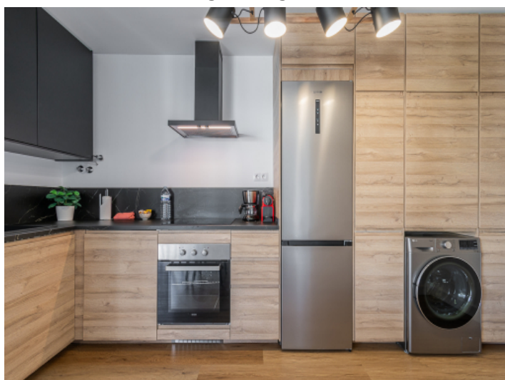
Kitchen with appliances