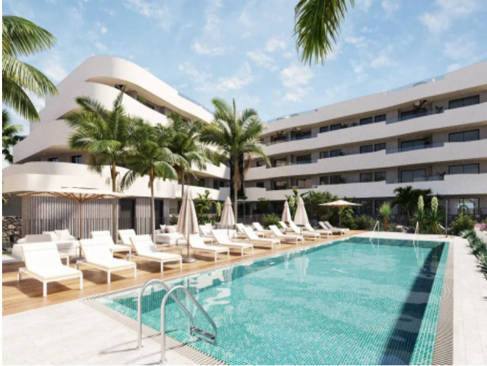
Superb pool area