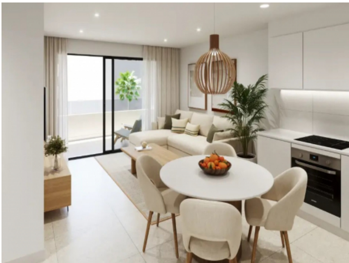
Dining area and kitchen