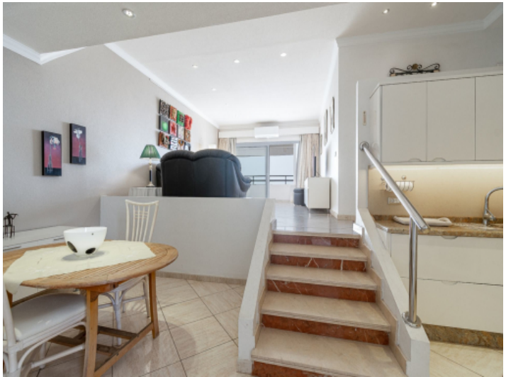
Dining and kitchen area