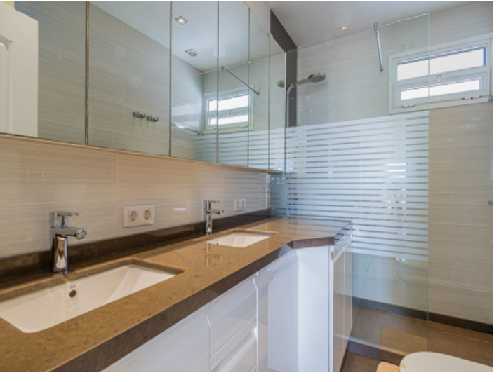
The flat offers 2 bathrooms