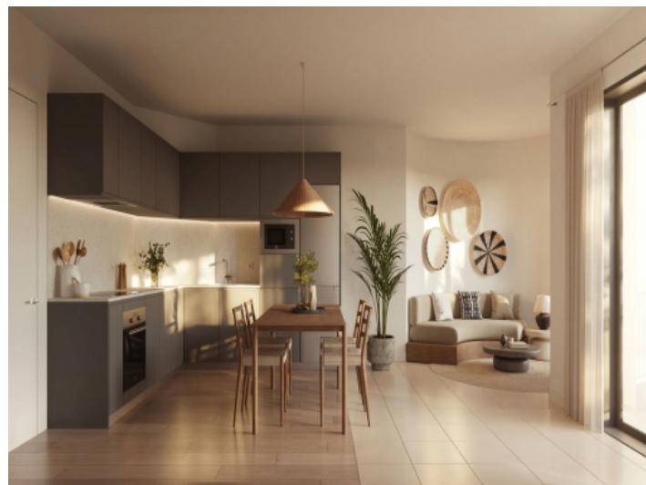
Kitchen and dining area