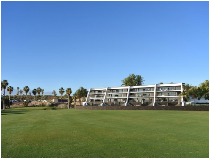
Views to the building