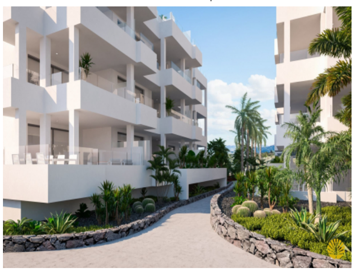
Entrance to the complex