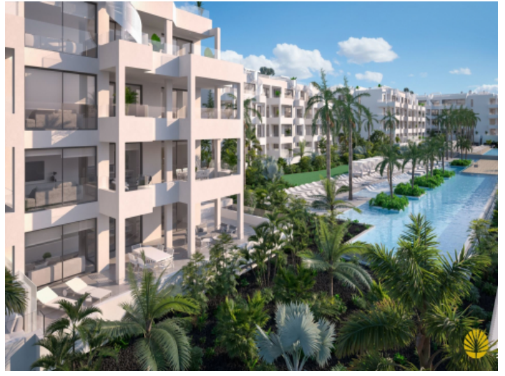
View to the complex