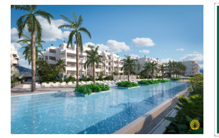
Palm Mar search for property TEN-107906