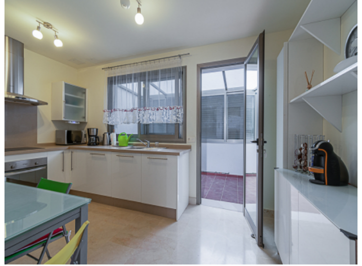
Kitchen with acces to a terrace