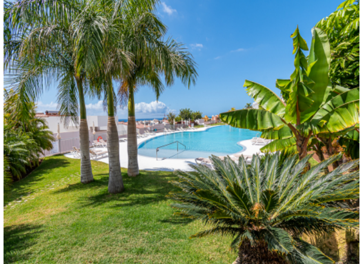
Very well mantained garden and pool area