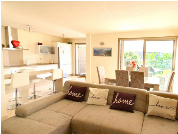
Open-plan living area