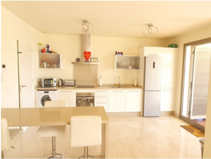
Kitchen with access to the terrace