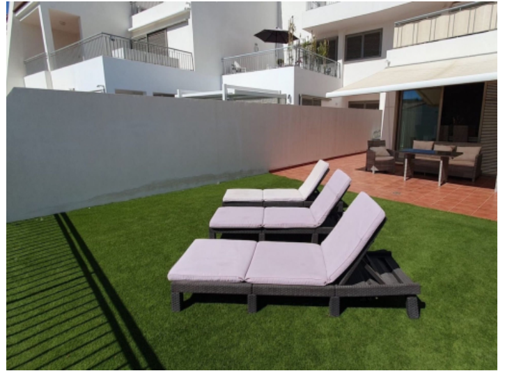
Terrace with sun loungers and outdoor dining area