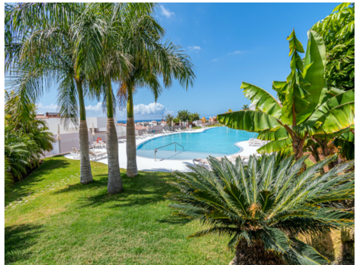
Community pool surrounded by a garden