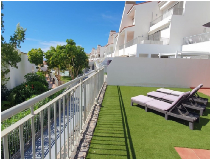
Large sunny terrace