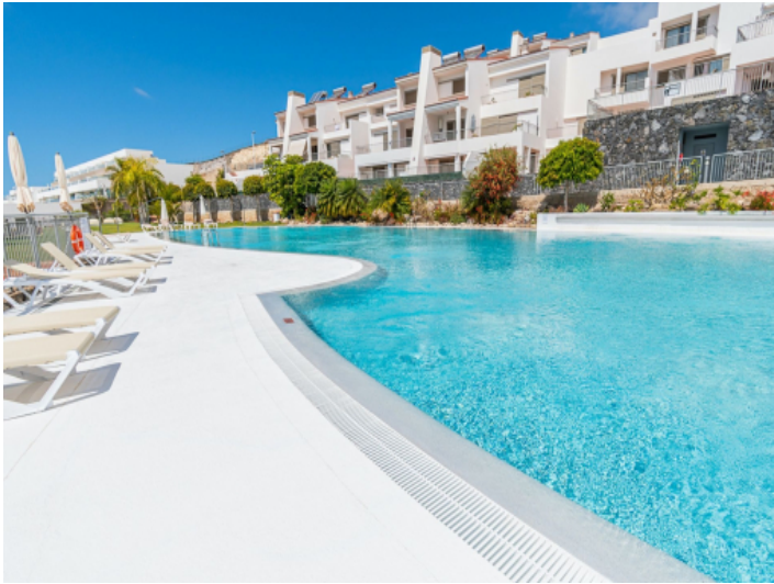
Lovely pool area