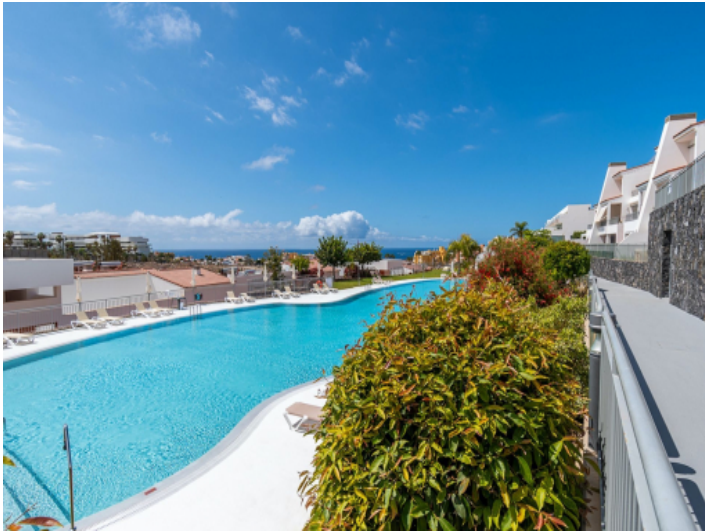
Very large community pool