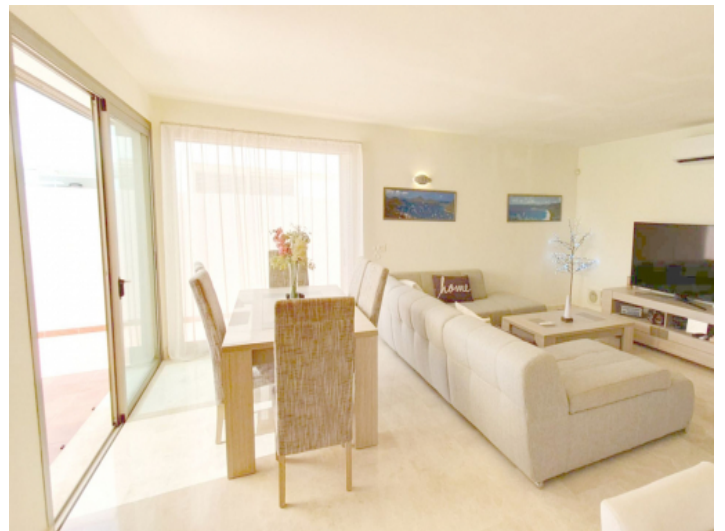
Light-flooded living and dining area