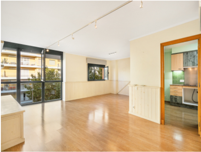
Beautiful and bright apartment 4 bedrooms 2 bathrooms 3rd