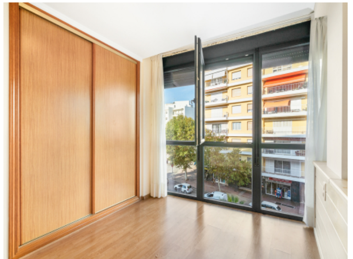
Bedroom with floor to ceiling windows