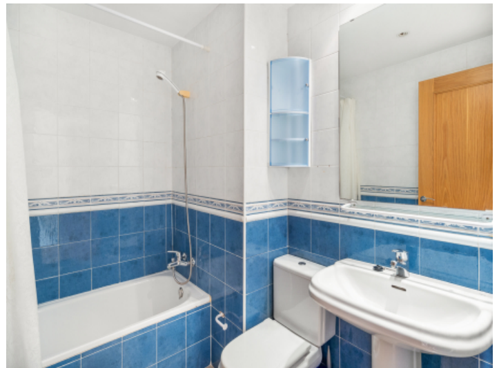
Bathroom with shower