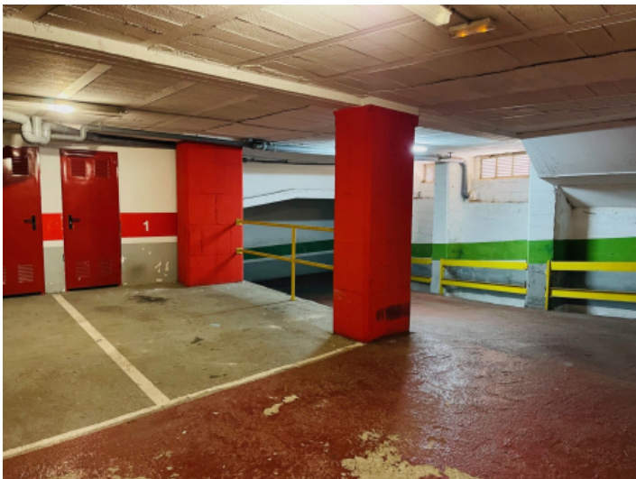
Underground parking space