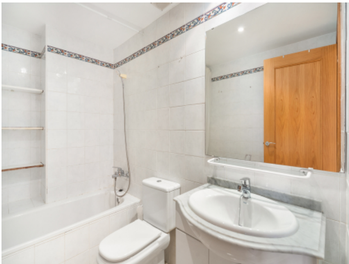
Bathroom bath bathtub