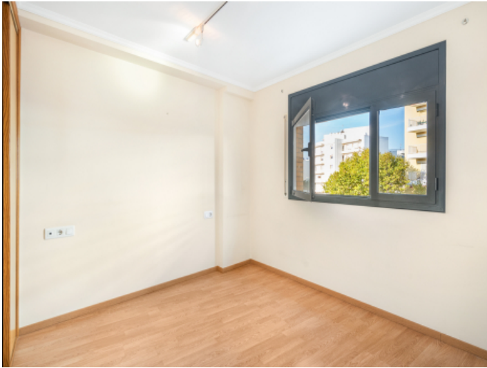
Bedroom with daylight