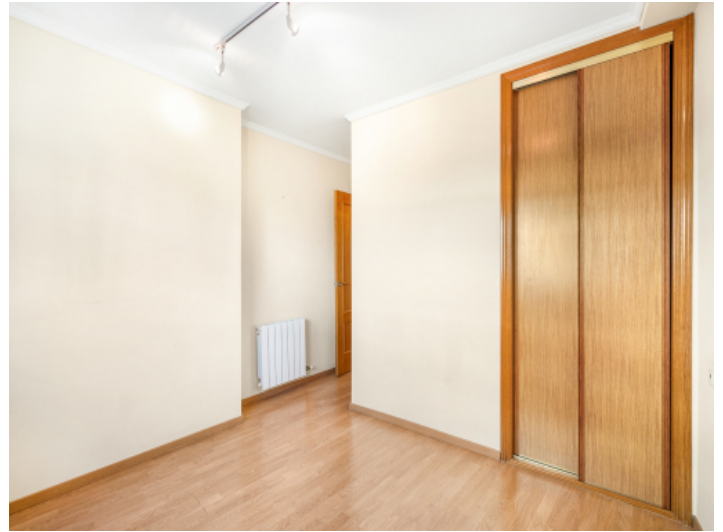
Bedroom with built-in wardrobes