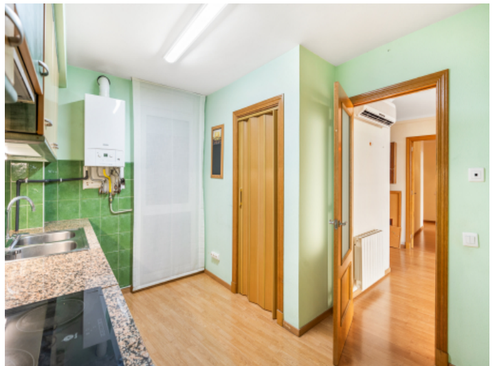
Views from the kitchen to the living area