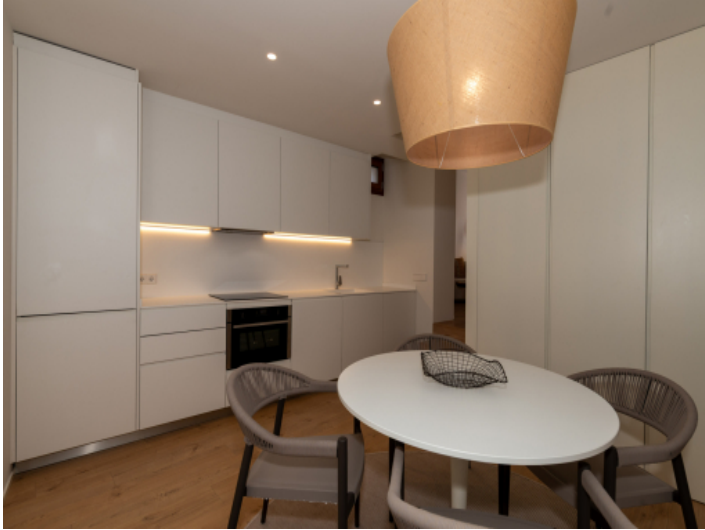
Kitchen with dining area