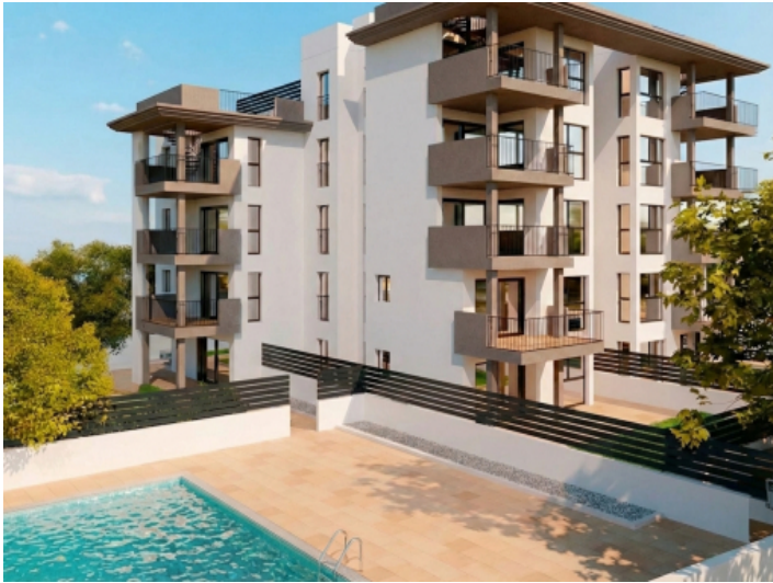
Newly built apartments in Cala Millor