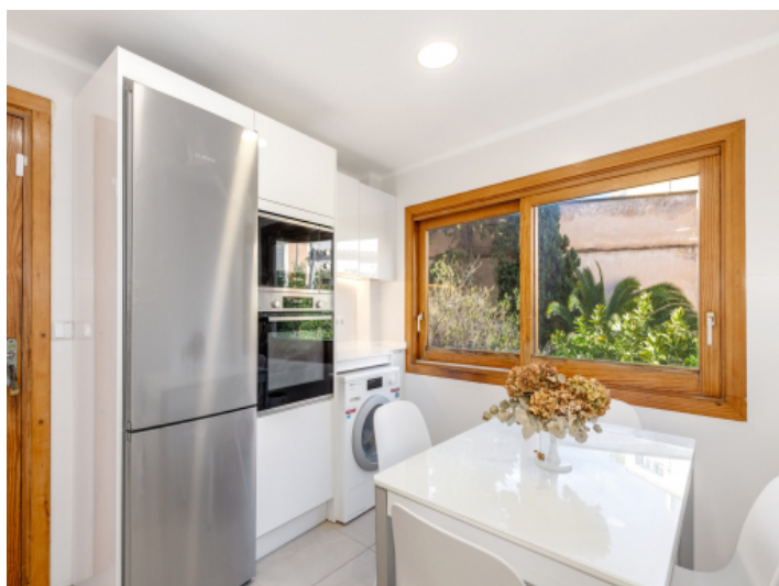
Kitchen dining area