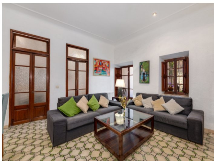
Comfortable living room