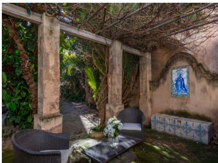
Corner in the garden