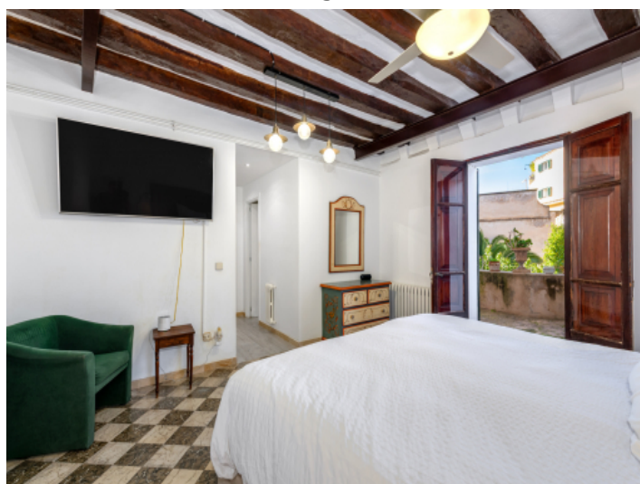
Bedroom in suite