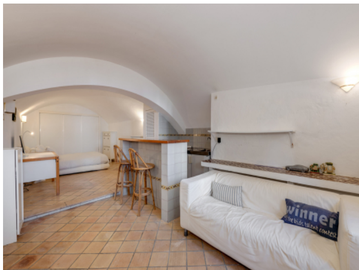
Cozy guest studio