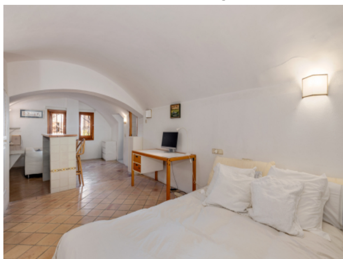
Separated guest studio