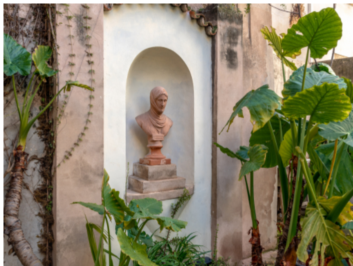
Details of the garden