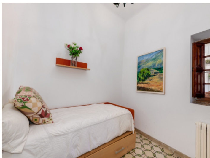
One of the 5 bedrooms