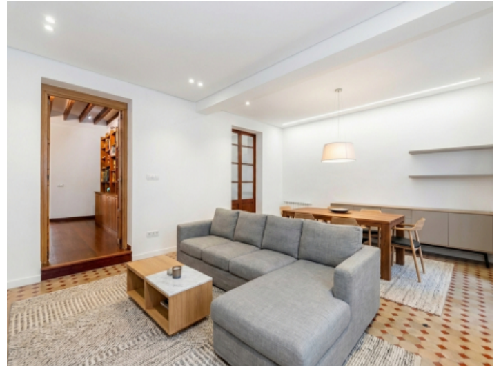
Livingroom furniture hotstaging