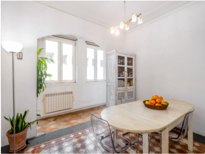
Second dining area