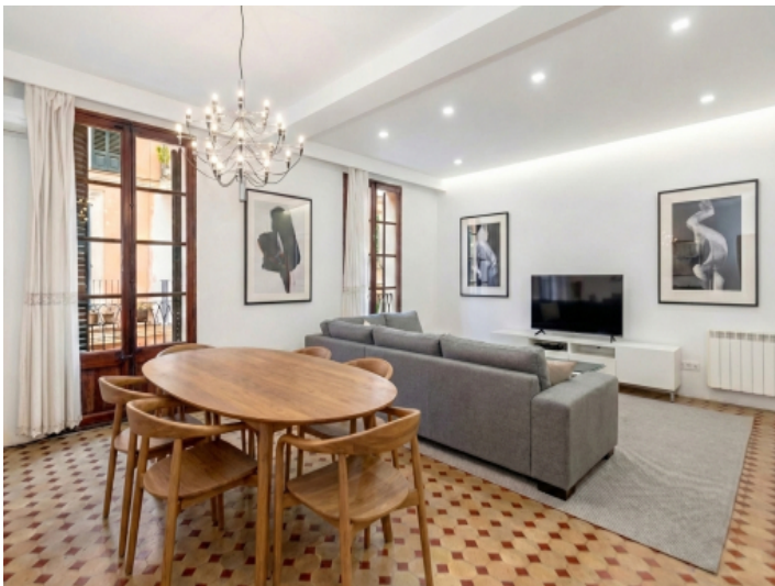
Dining area-furniture home staging