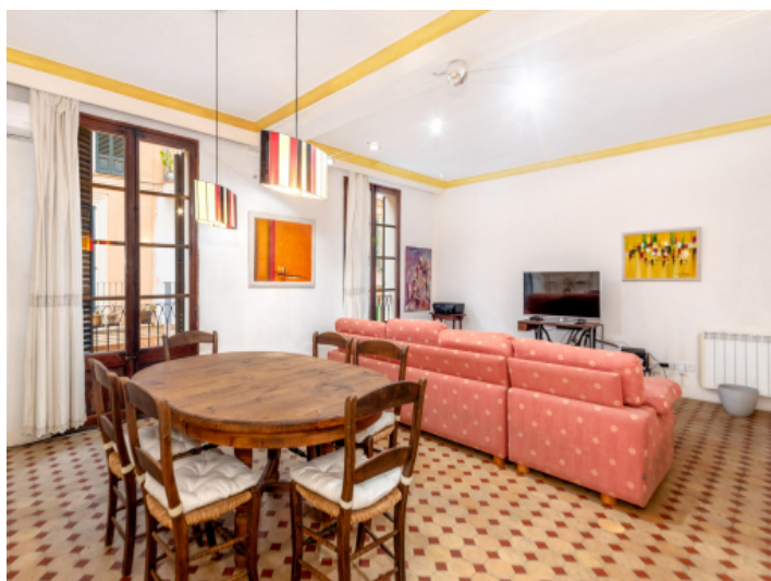
Actual dining area