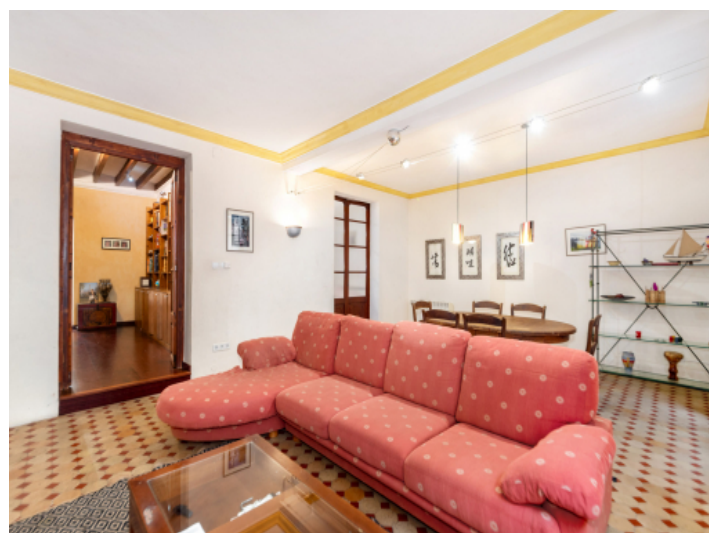
Actual Living area