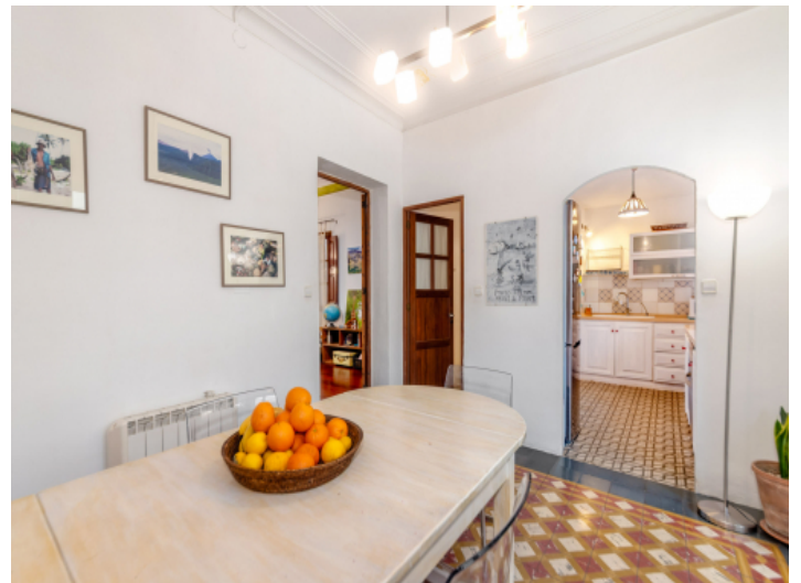
Second dining room