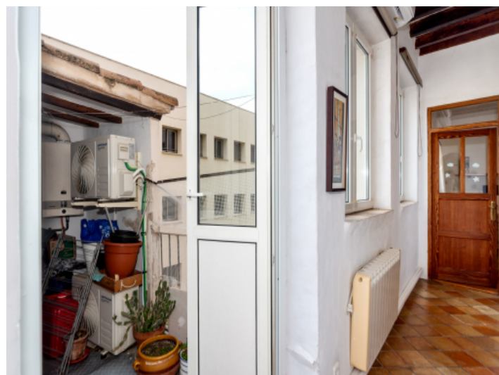
Possible covered terrace