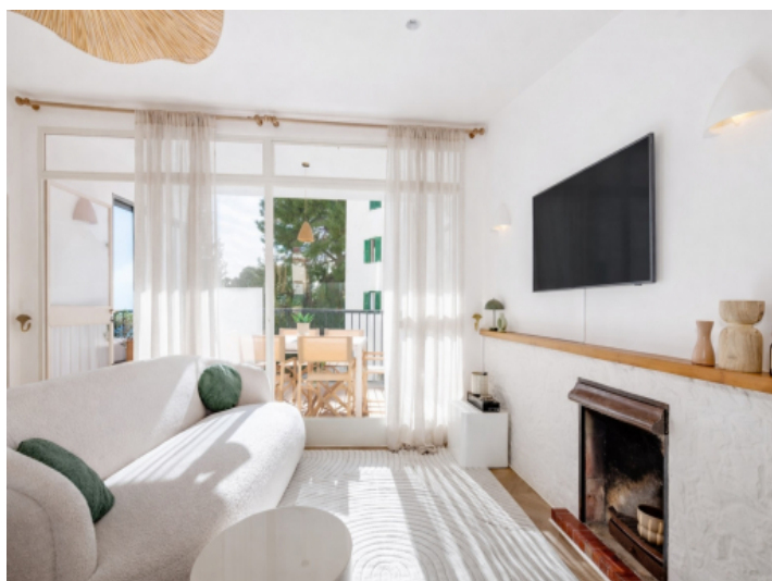
Living area with access to the covered terrace