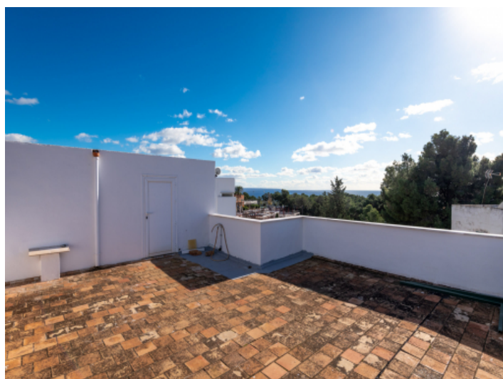
Community rooftop terrace