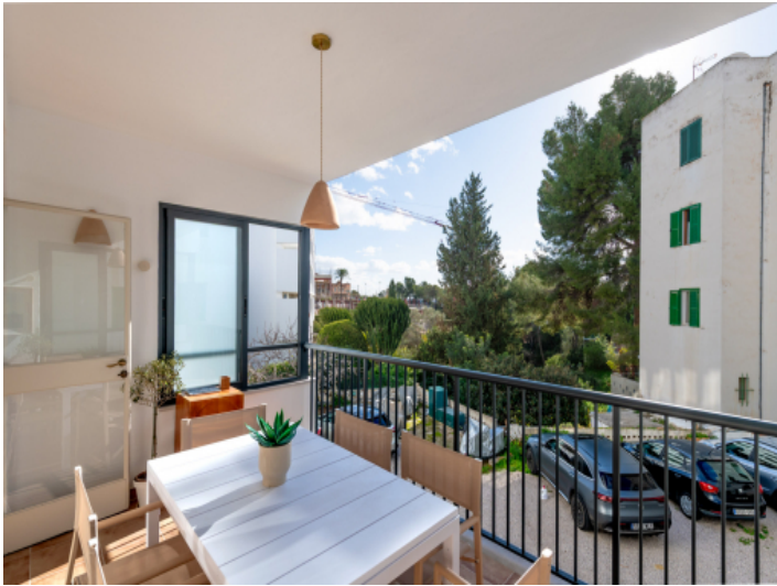
Spacious covered terrace