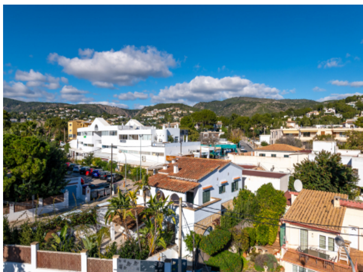
View from the rooftop terrace