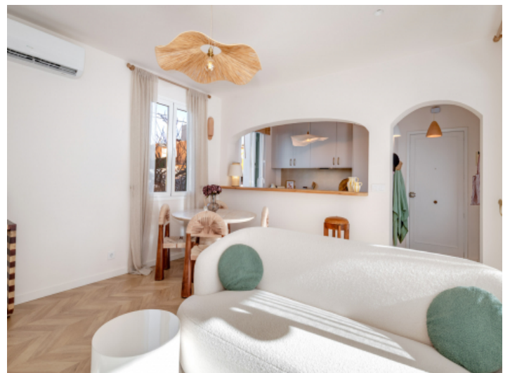
Open-plan living and dining area