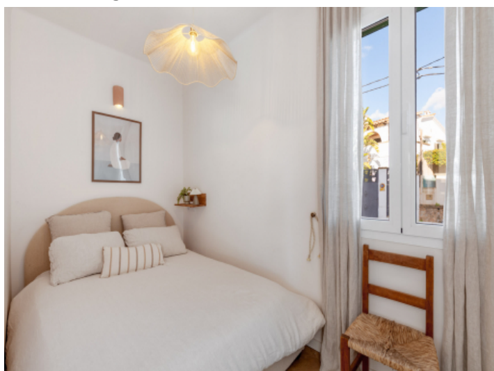
One of the two bedrooms