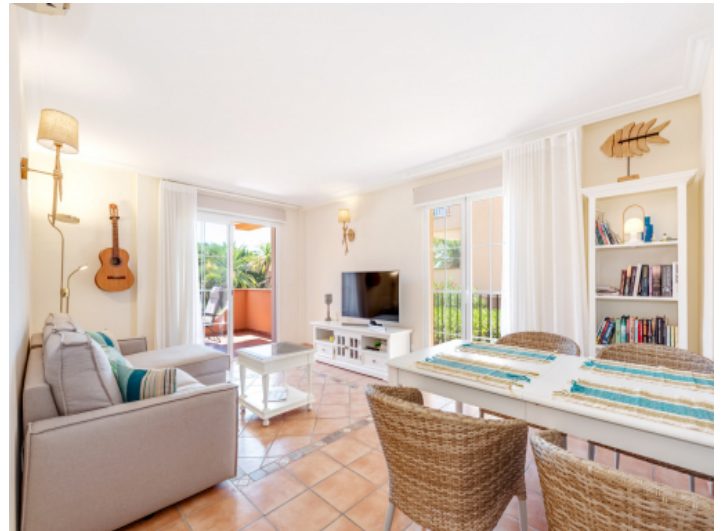
Bright living and dining area with large windows