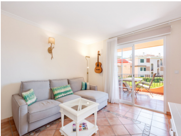
Living area with direct access to the terrace