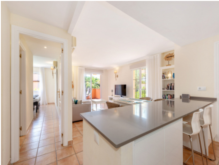
Modern, open kitchen