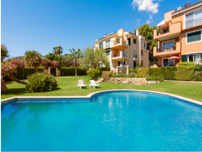
Inviting community pool to enjoy sunny days