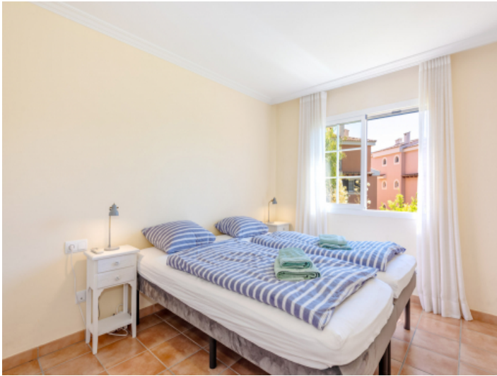
One of the two bright bedrooms