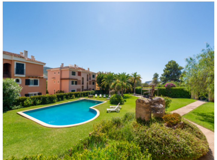
Quiet community with well-maintained green areas