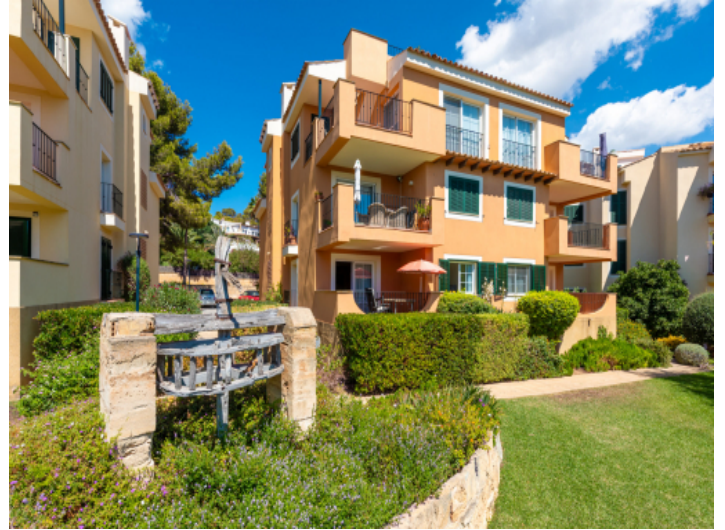
Well-maintained garden area with Mediterranean charm