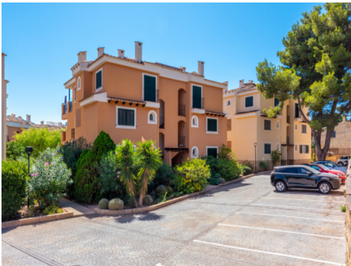
Quiet community with private parking space