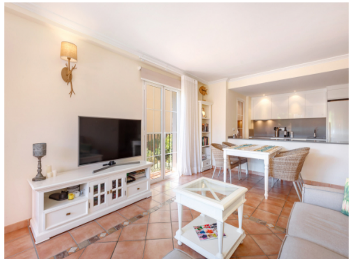
Living and dining area with Mallorcan charm