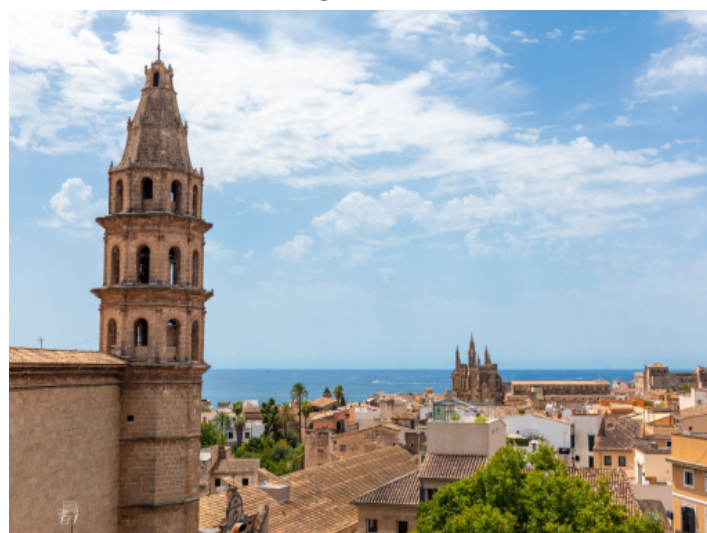
View over the cathedral and the sea