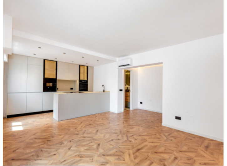
Spacious and bright living/dining area