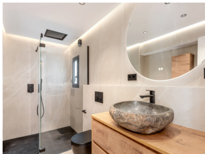
Second guest bathroom