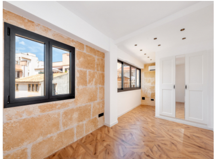
Built-in wardrobes and a work corner in one of the bedrooms