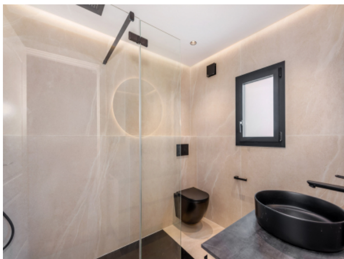
Stylish master bathroom