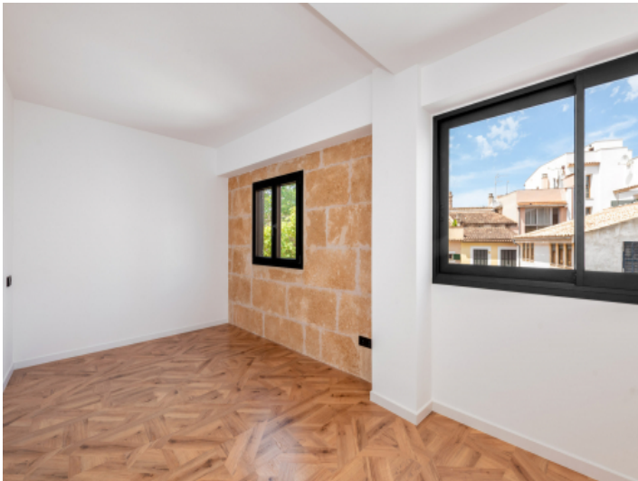
One of the two bedrooms with large windows