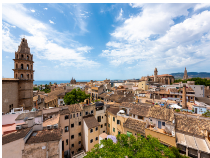
View over the rooftops of Palma's old town