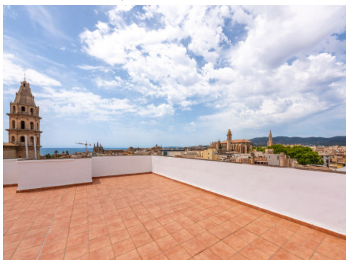
Shared terrace with incredible panoramic views