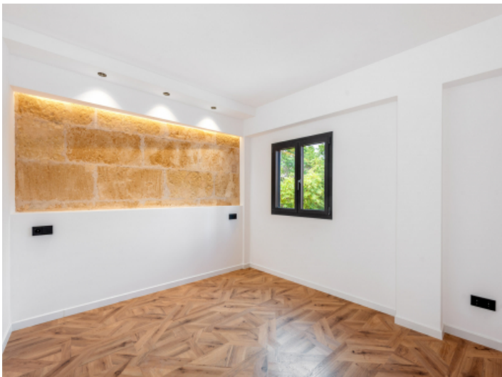
Master bedroom with private dressing area