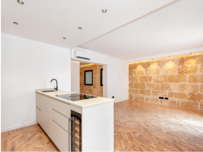
Open view from the kitchen to the beautiful Marès stone wall