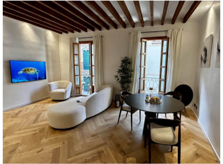
Cozy living and dining area