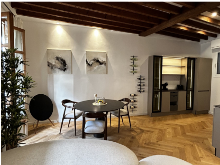
Dining area / Kitchen