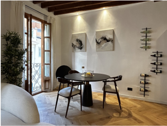
Bright, light-filled dining area