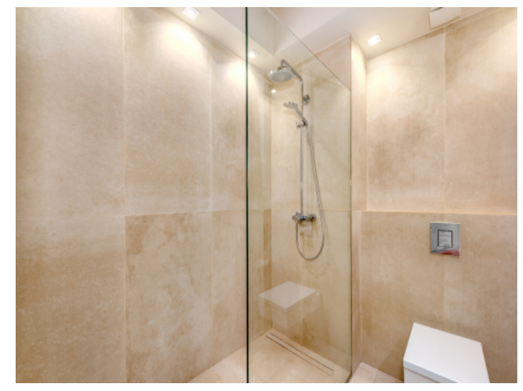
One of the two bathrooms