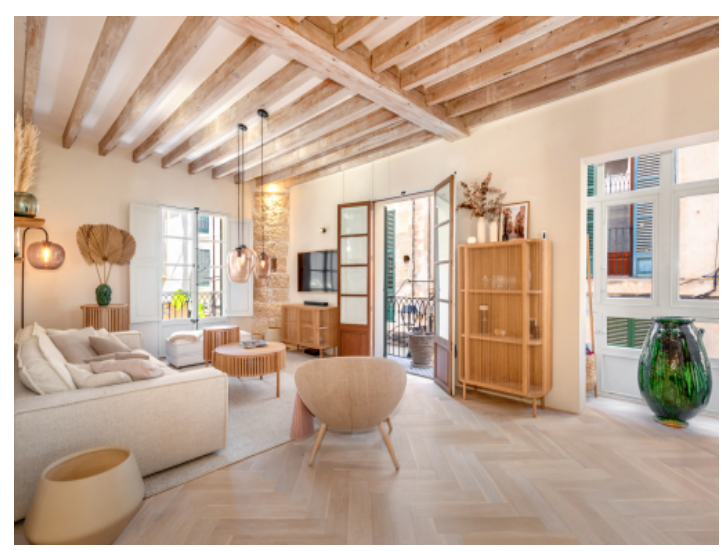
Spacious, bright living area