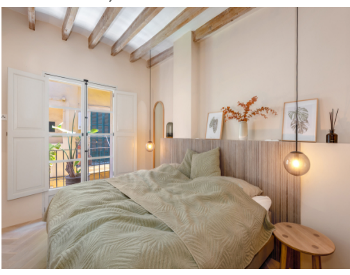
Master bedroom with original ceiling beams

PORTA MALLORQUINA • C./ COLOM 20 2°, 07001 PALMA, SPAIN TEL.: +34 971 698 242 • INFO@PORTAMALLORQUINA.COM • WWW.PORTAMALLORQUINA.COM