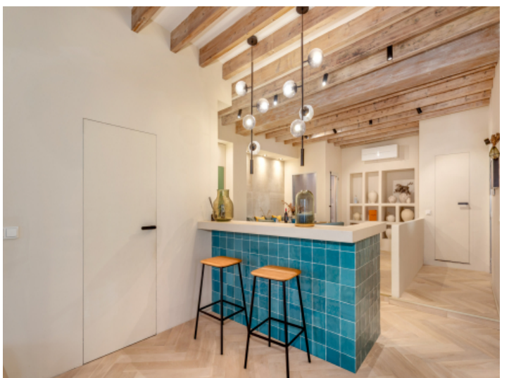
Open kitchen and dining area