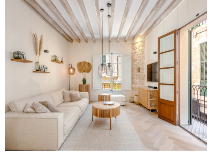
Renovated old town apartment with traditional design