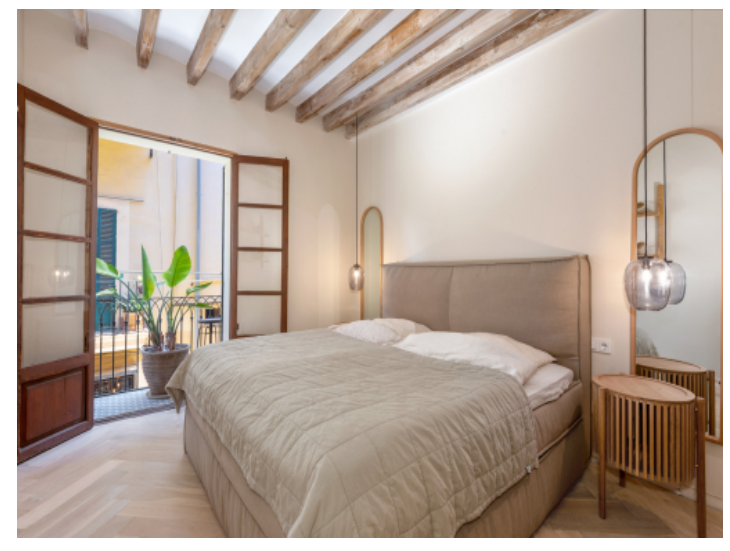
Second bedroom with french balcony