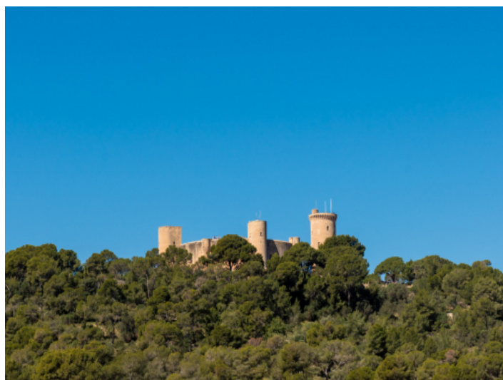
View to castle Bellver