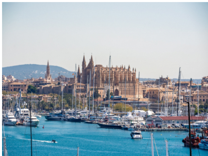
View to cathedral