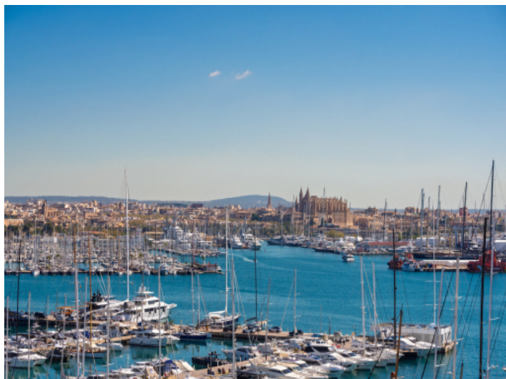
View to harbour