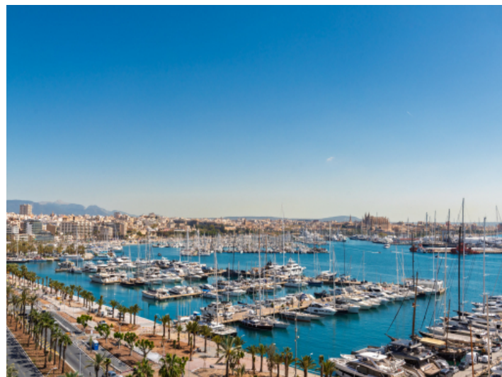
View to Paseo Marítimo