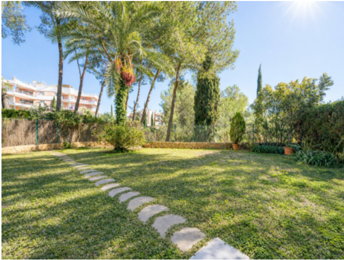
Big private garden