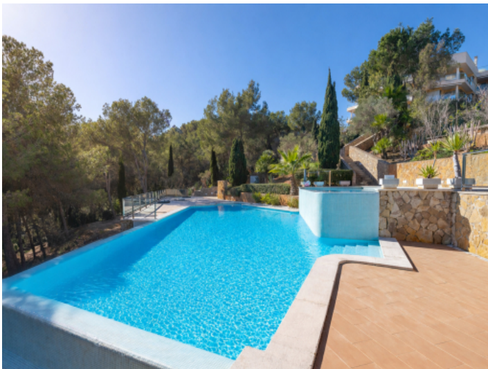
Well maintained community