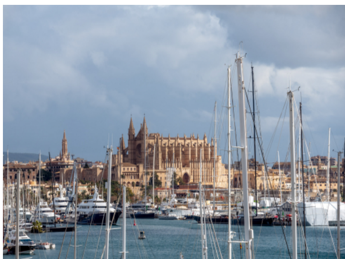
Views to the cathedral