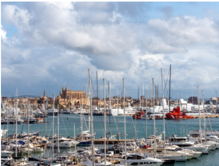
Views to the harbour and the cathedral