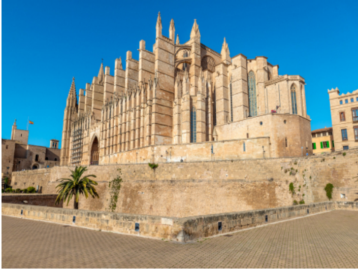
Cathedral La Seu