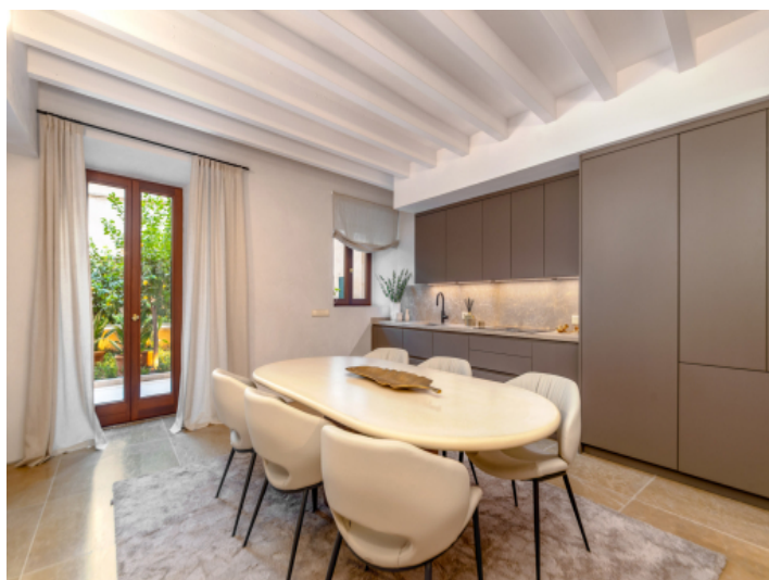
Exclusive triplex-apartment with private garden and separate