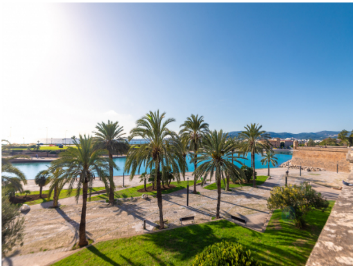
Parc de la Mar