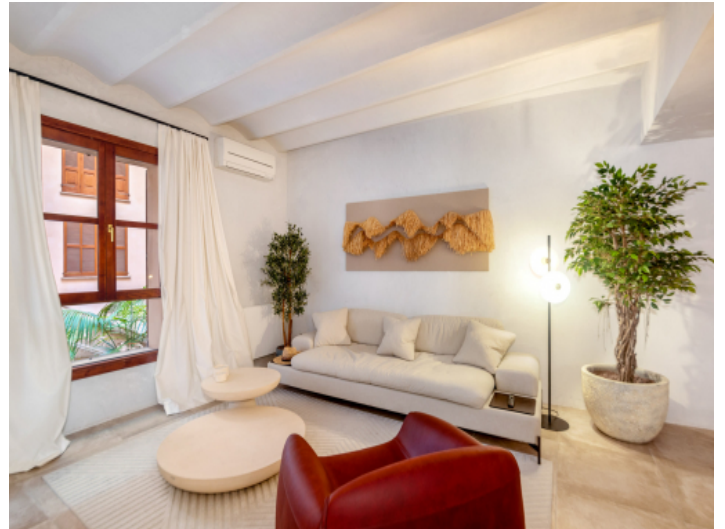
Elegant living area