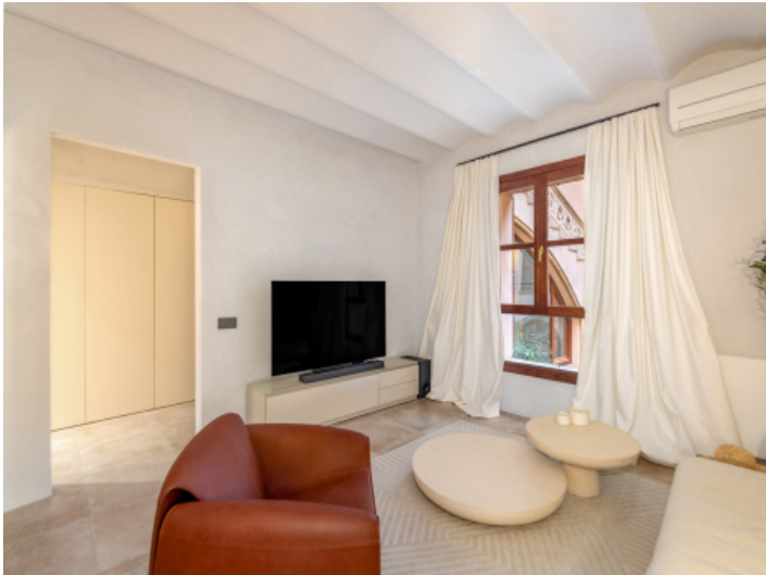
Beautiful living area