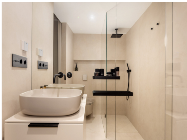
Modern bathroom with walk in shower