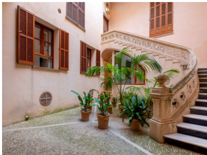
Typical mallorcan patio