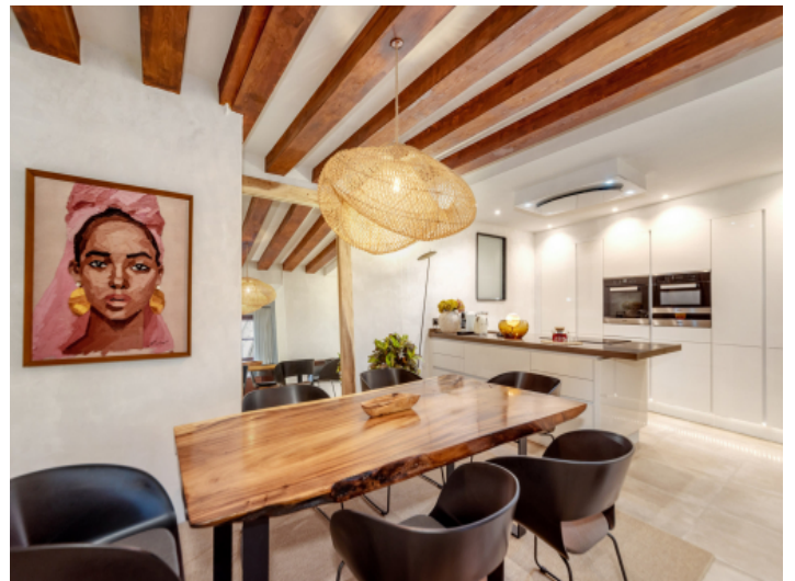
Beautiful dining area