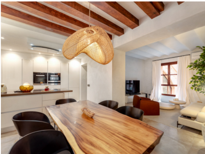
Dining area and kitchen