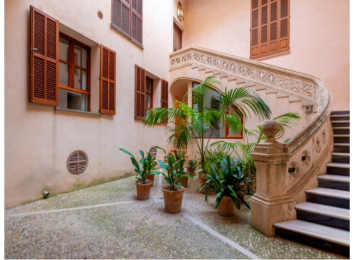
Typical mallorcan patio