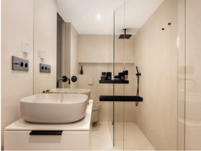
Modern bathroom with walk in shower