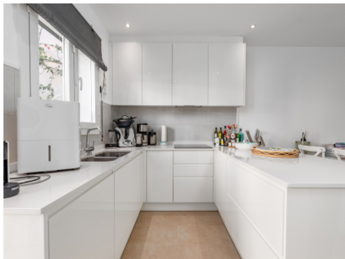
Modern, fully equipped kitchen