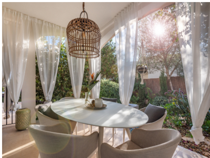
Lovely covered terrace