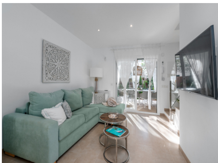
Light-flooded living area