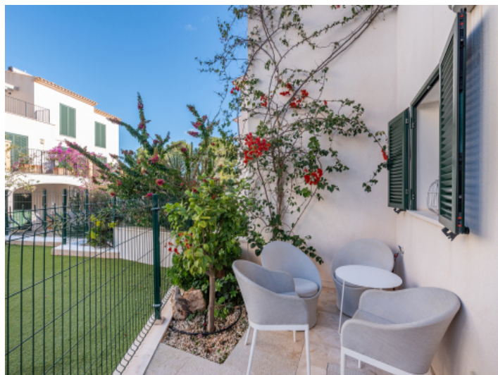
Additional terrace with seating