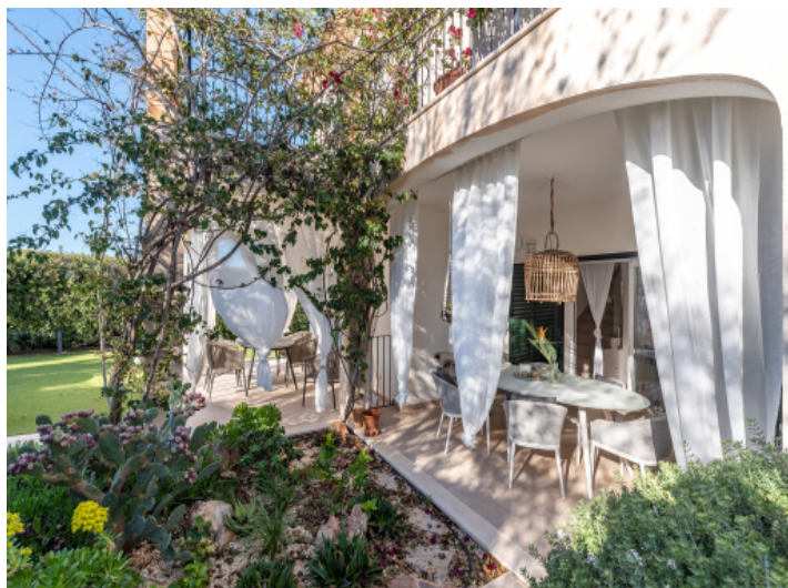
Terrace and garden