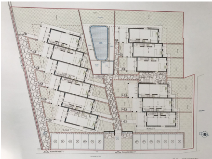
Plan residential complex