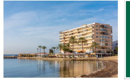
Can Pastilla search for property MAL-122010