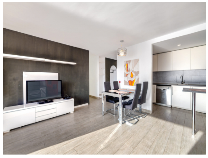
Bright living and dining area