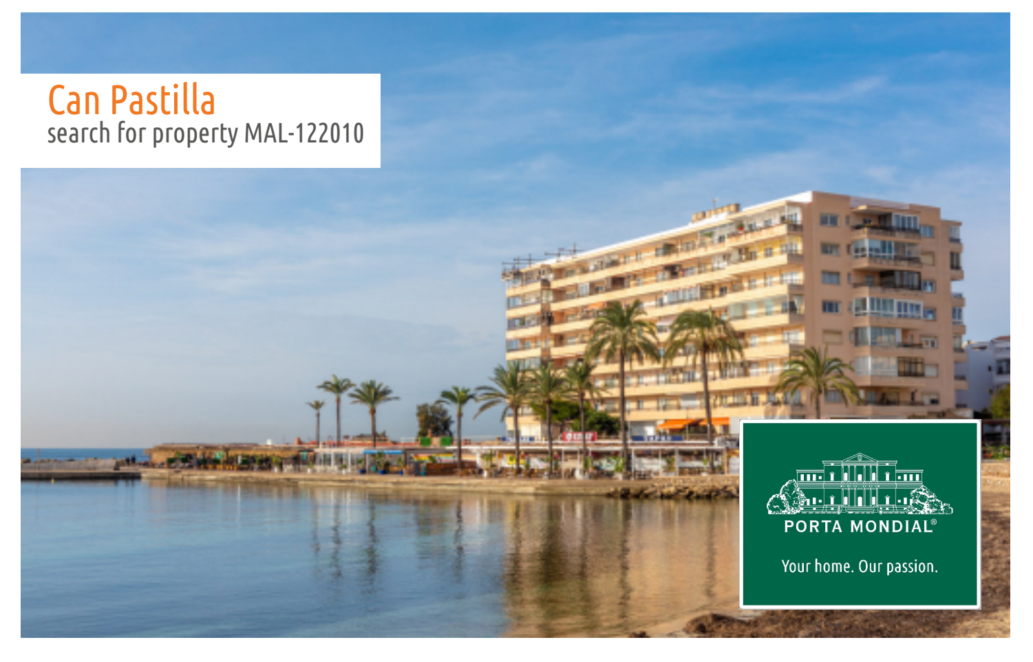
Apartment with breathtaking sea views in Can Pastilla