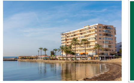
Can Pastilla search for property MAL-122010