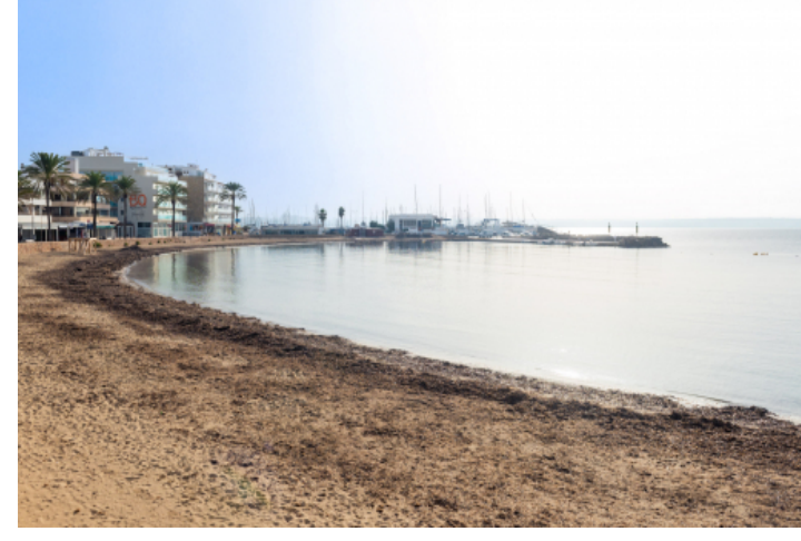
The beach is on your doorstep

PORTA MALLORQUINA • C./ COLOM 20 2°, 07001 PALMA, SPAIN TEL.: +34 971 698 242 • INFO@PORTAMALLORQUINA.COM • WWW.PORTAMALLORQUINA.COM