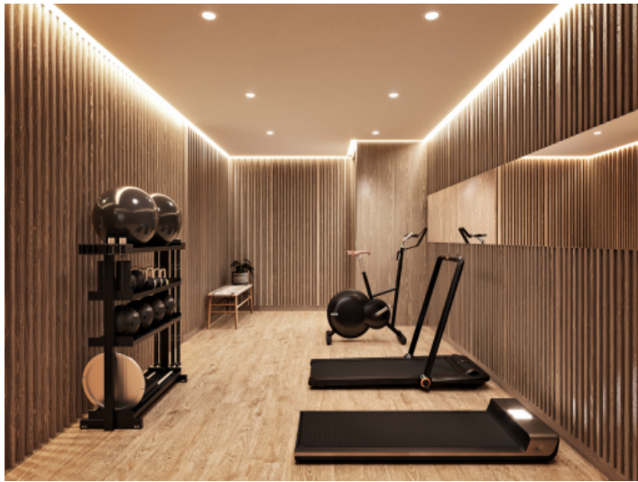
Community area with fitness area