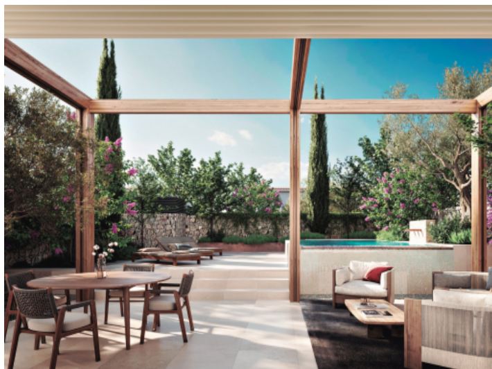
Patio with private pool