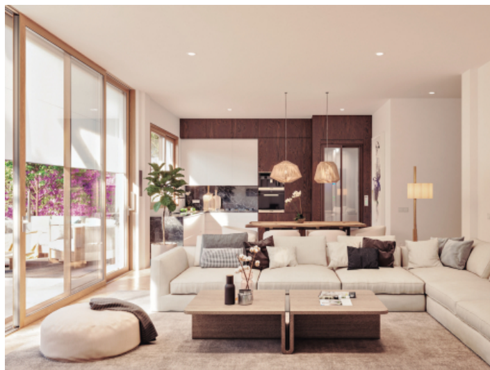
Bright living area