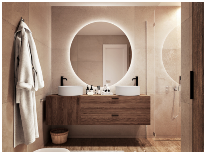
Flat with 2 bathrooms