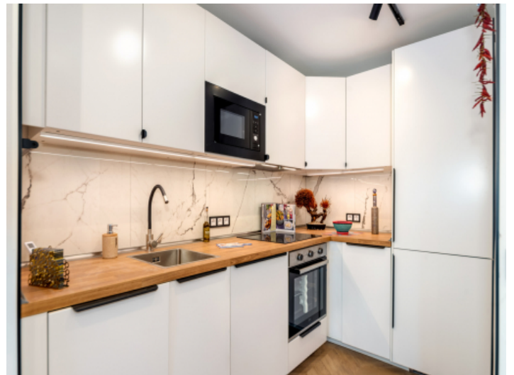
Fullu equipped kitchen