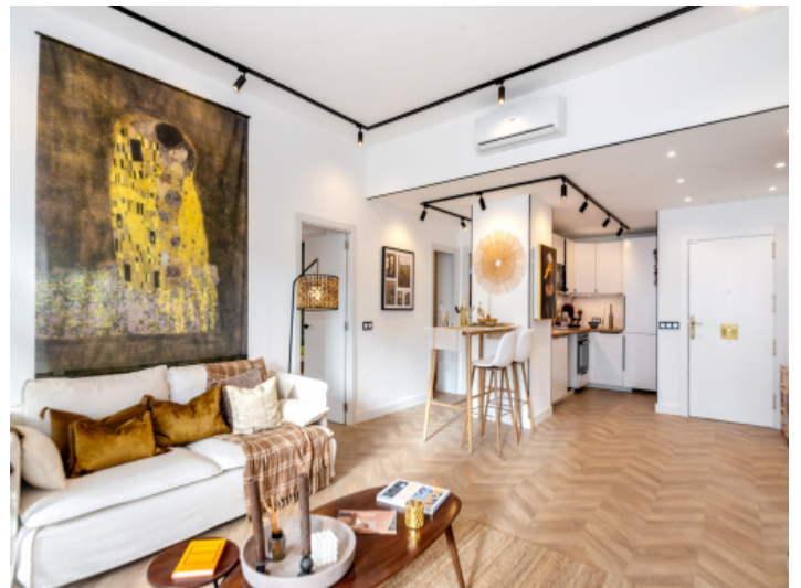
Open room layout