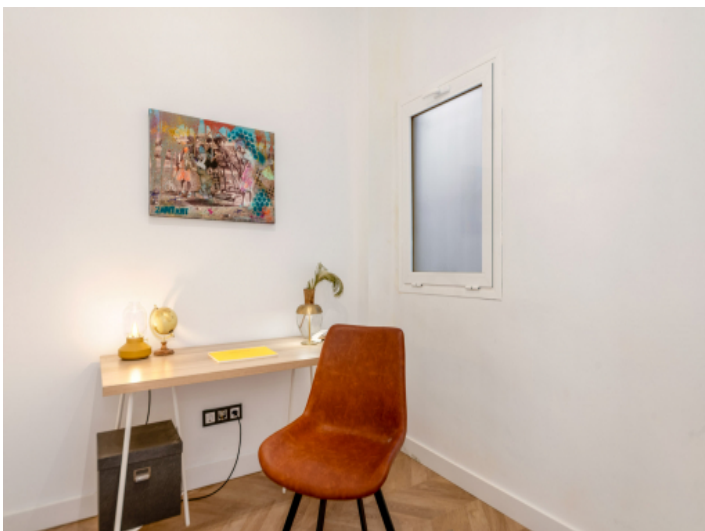
Study room or bedroom