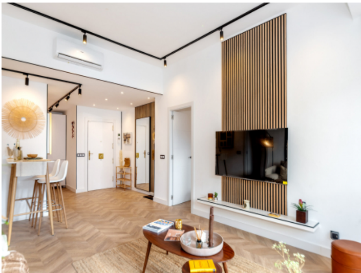
Living and entrance area