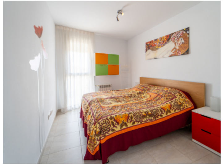
One bedroom apartment