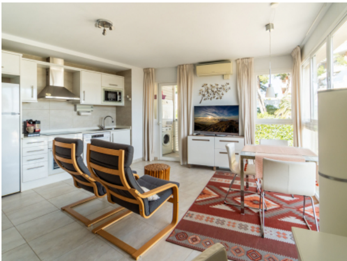
Living, dining and kitchen area