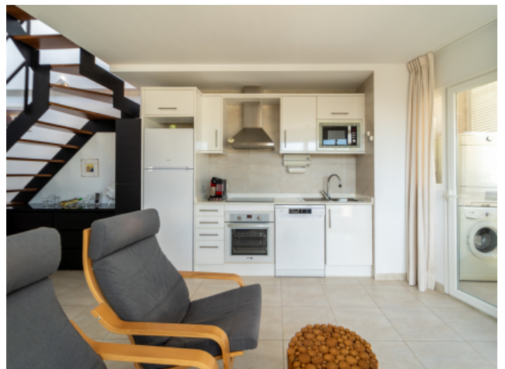
Living, dining and kitchen area