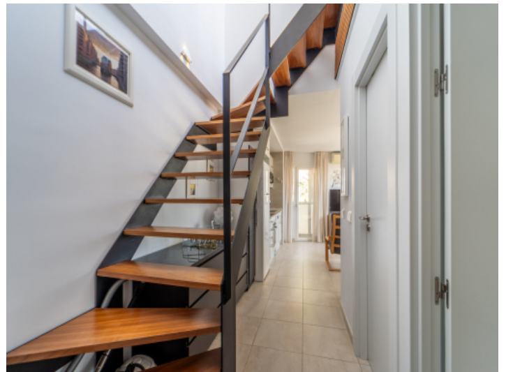
Stiarcase to the rooftop terrace