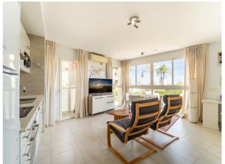
Living, dining and kitchen area