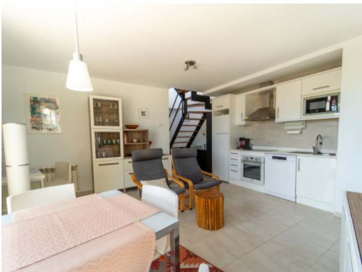
Living, dining and kitchen area