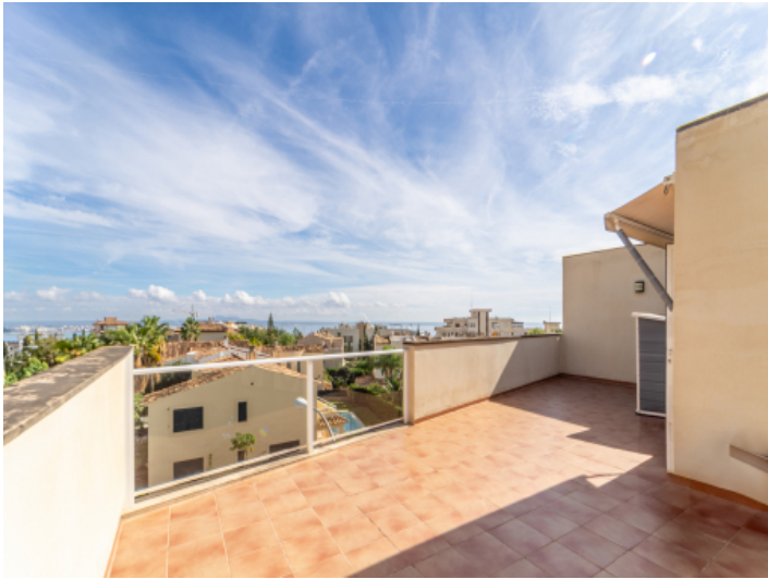
Rooftop terrace with sea views