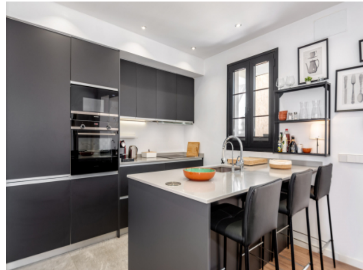
Living area Kitchen