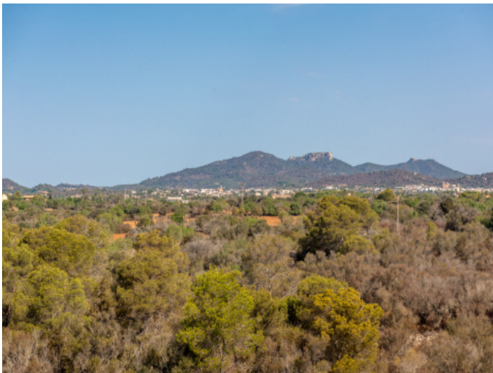
Views to Sant Salvador