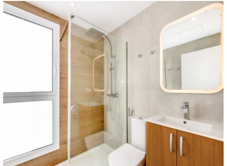
Bathroom with walk - in shower