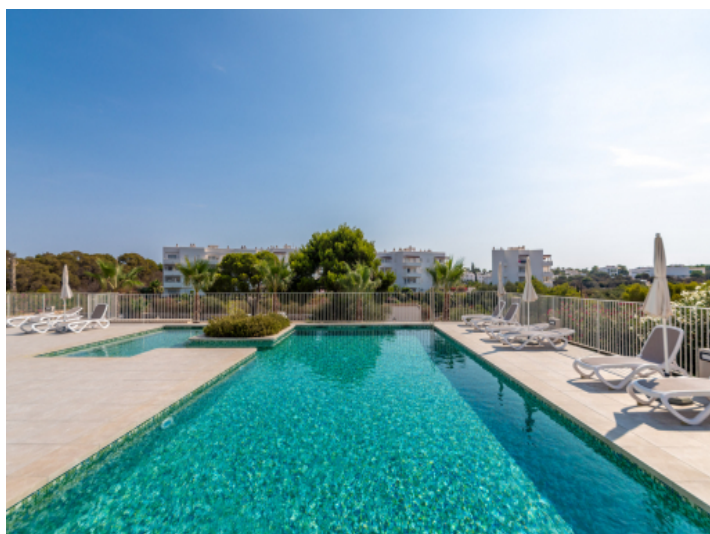
Large community pool