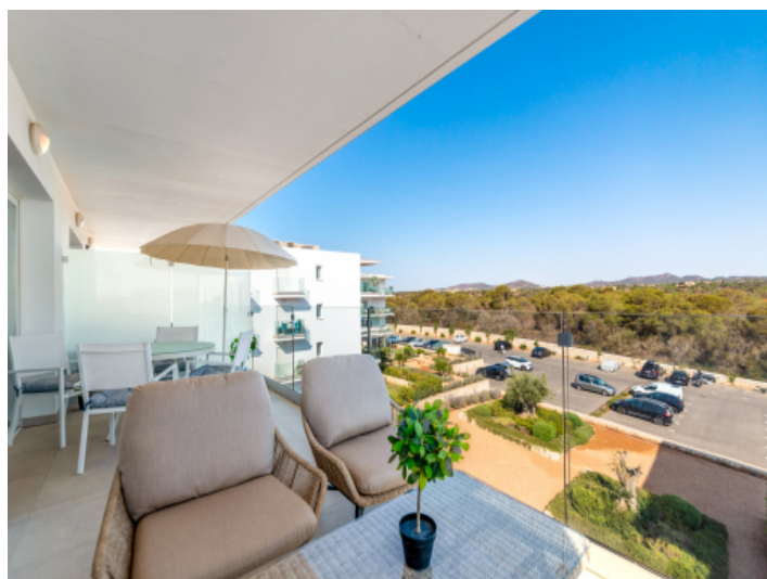
Terrace with far-reaching views