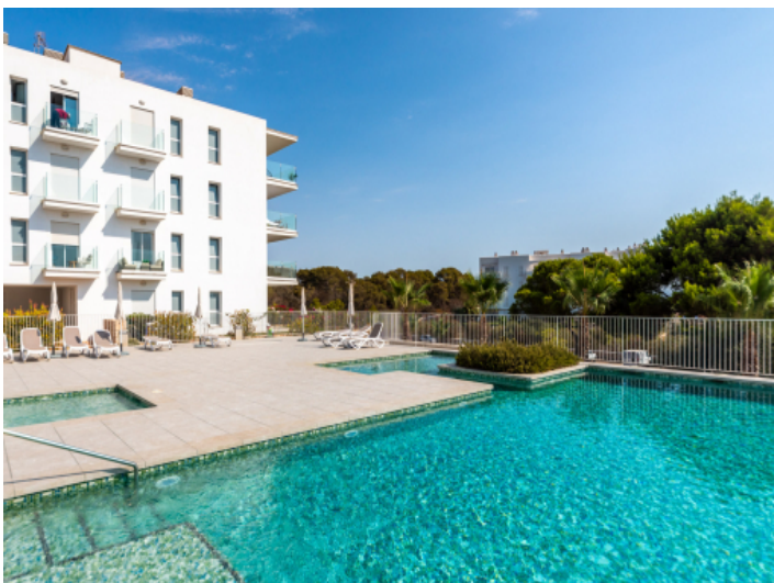
Facade and pool