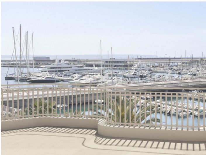
Newly built apartment with spectacular sea views and