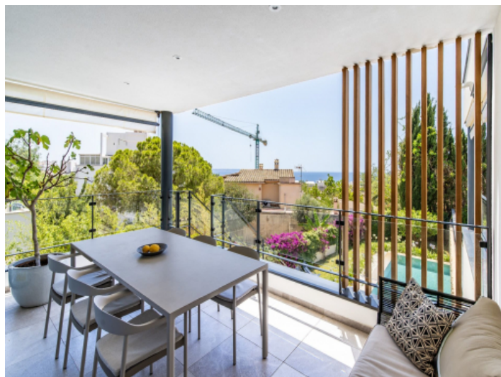
Terrace with views