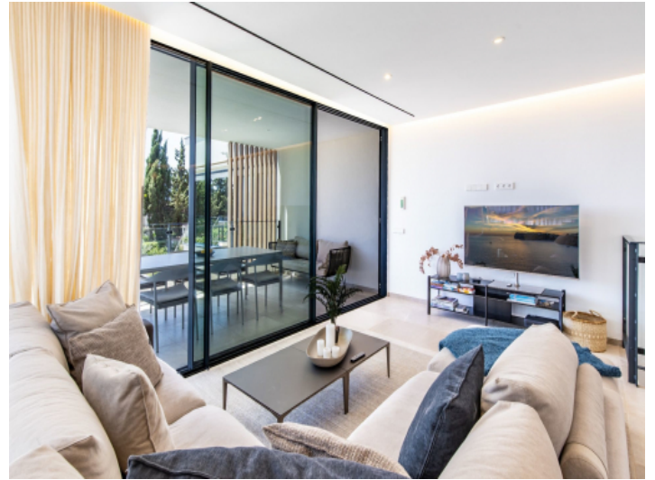
Comfortable living close to Palma city center