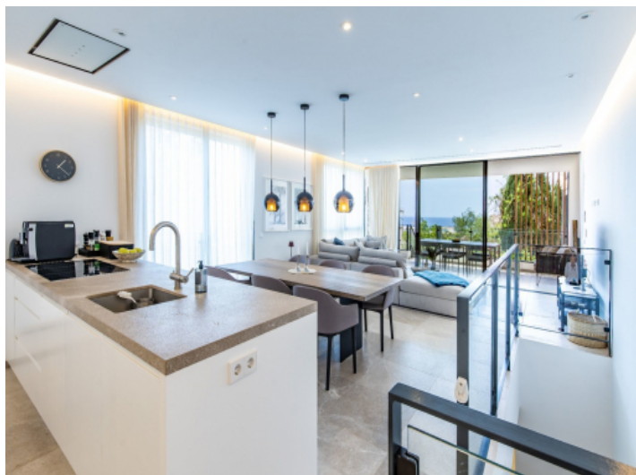
Living, dining and cooking