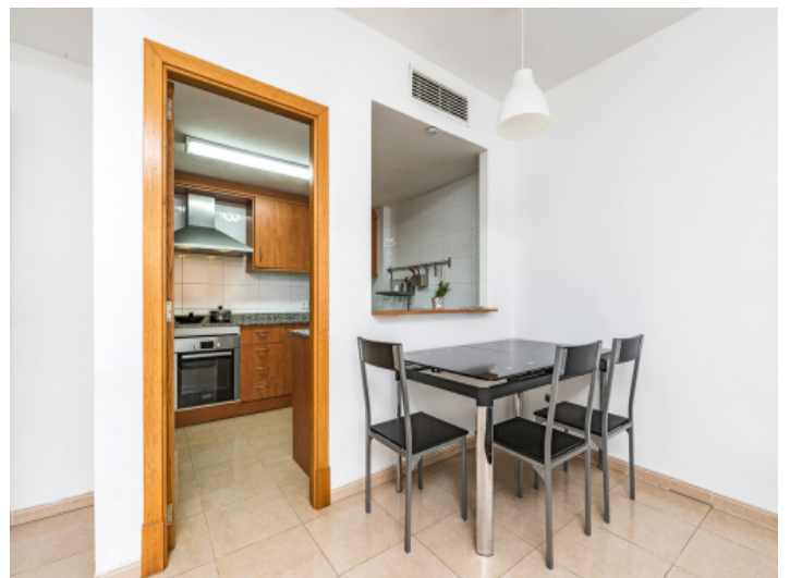
Pass-through between kitchen and dining area