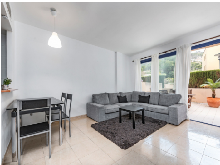
Beautiful living and dining area