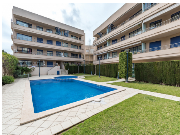
The apartment is ideal for a family