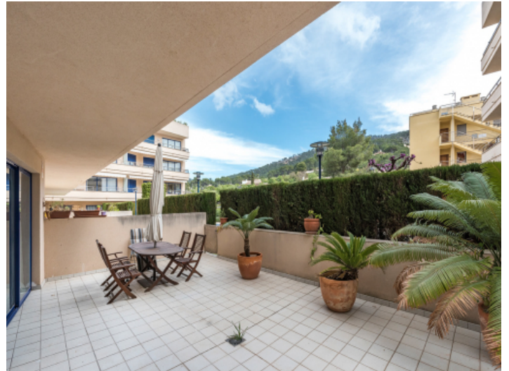
Large terrace with dining area