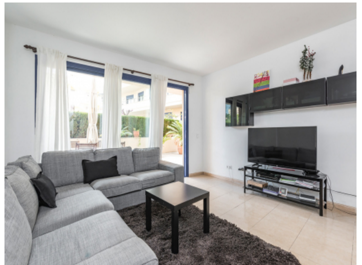
Comfortable living area with terrace access