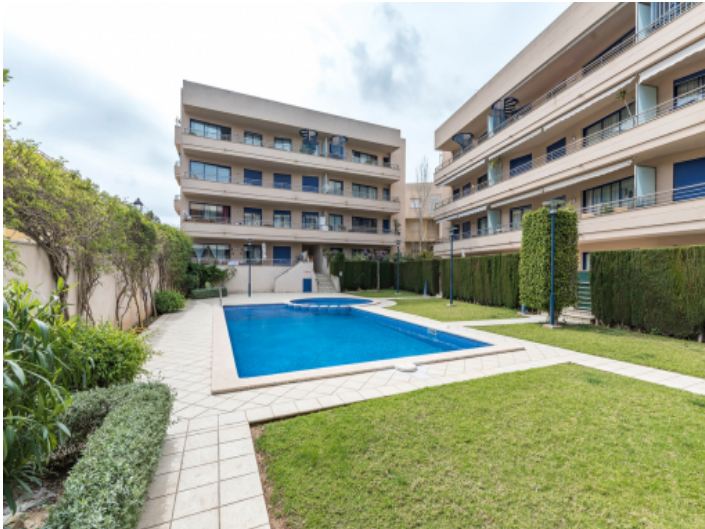
The apartment is situated in a well-tended residential