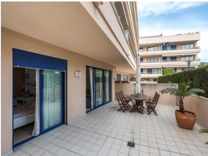
Partly covered and private terrace