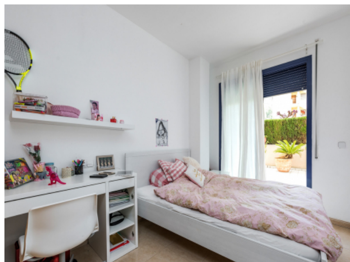
Lovely bedroom with terrace access