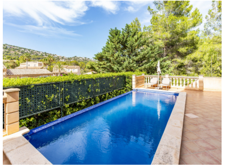
Luxurious apartment with panoramic views in Port Andratx