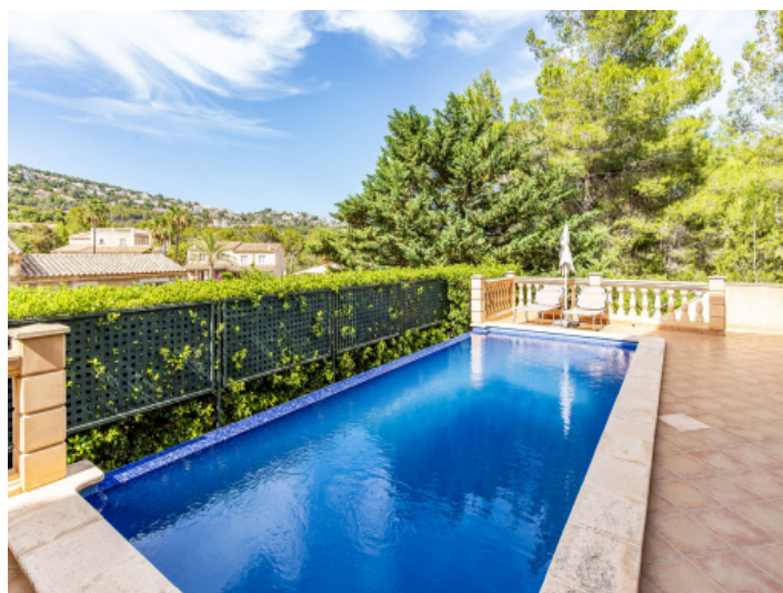
Luxurious apartment with panoramic views in Port Andratx