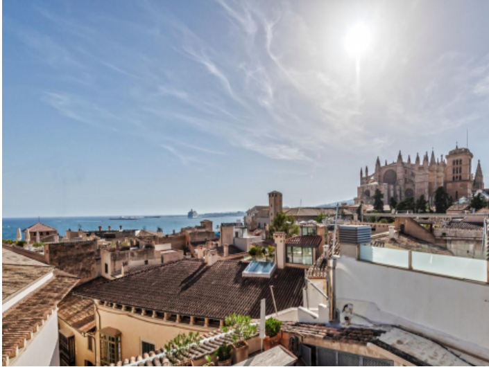
Views from the Lounge area