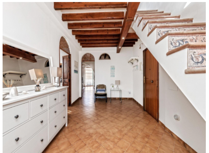
Staircase to the lounge area