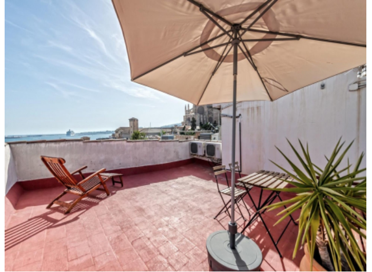
Community roof terrace