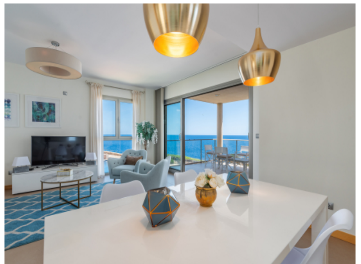
View from the kitchen into the living area