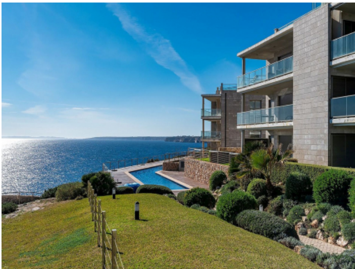
Very well maintained community garden