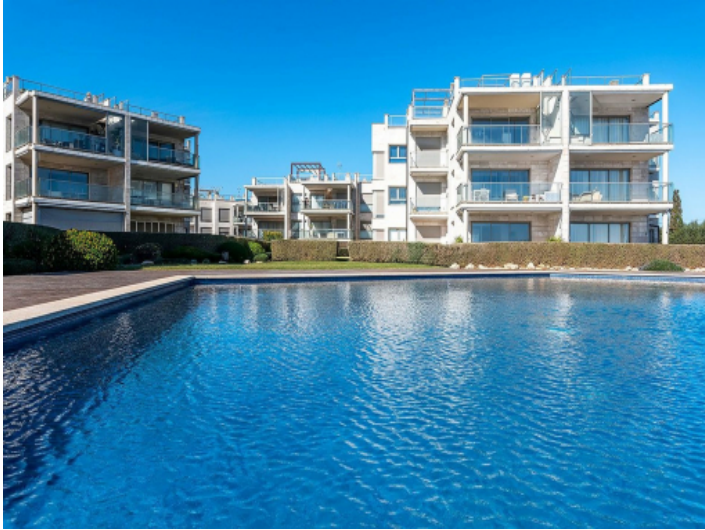
Large community pools