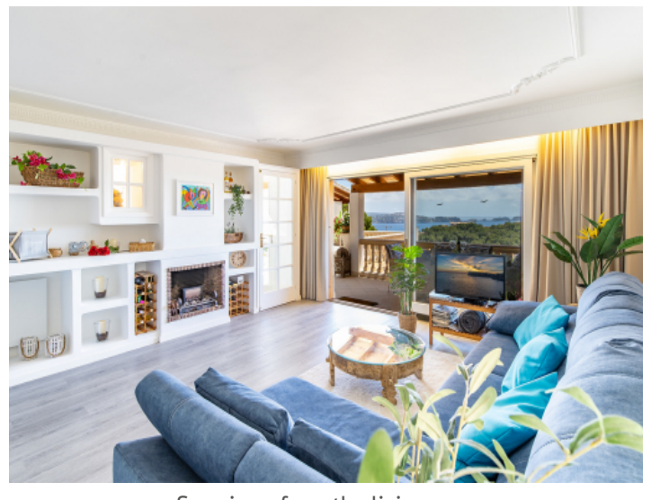
Sea views from the living area