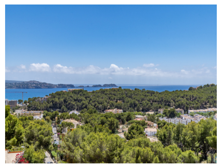
Mediterran sea views