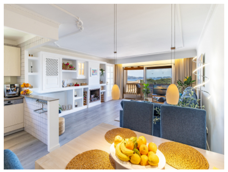
Open dining and living area