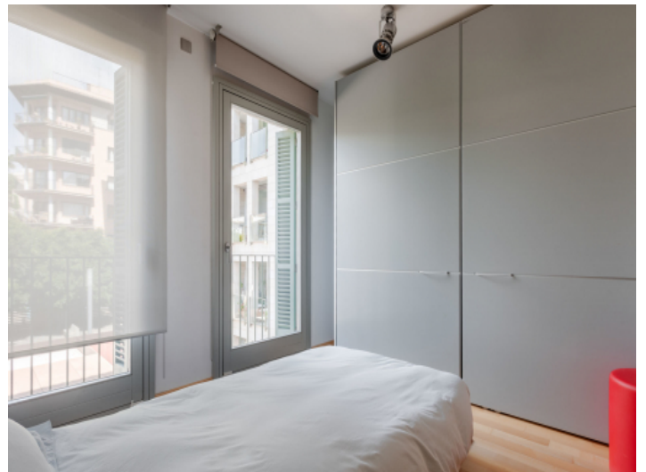
Large built-in wardrobes