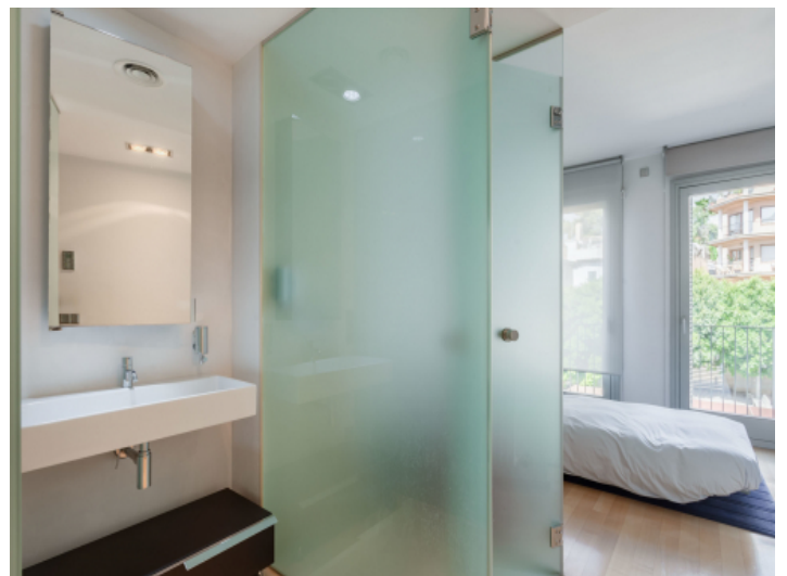
Bedroom with bathroom