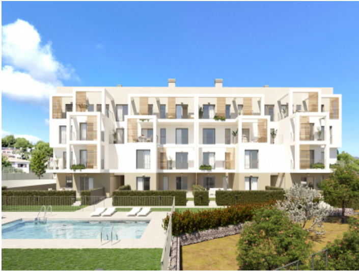
Pool and garden area