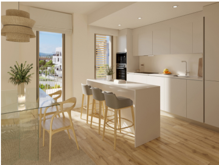
Dining and kitchen area