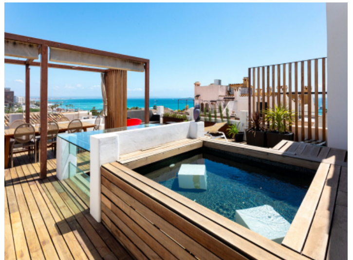
Rooftop with pool