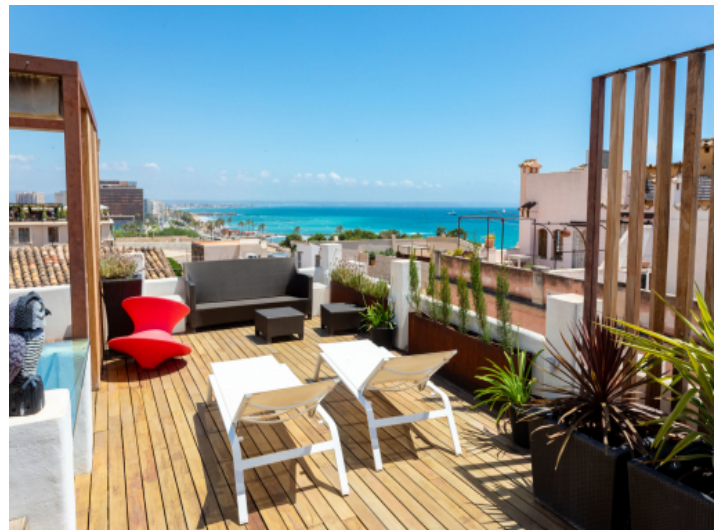
Close to the beach