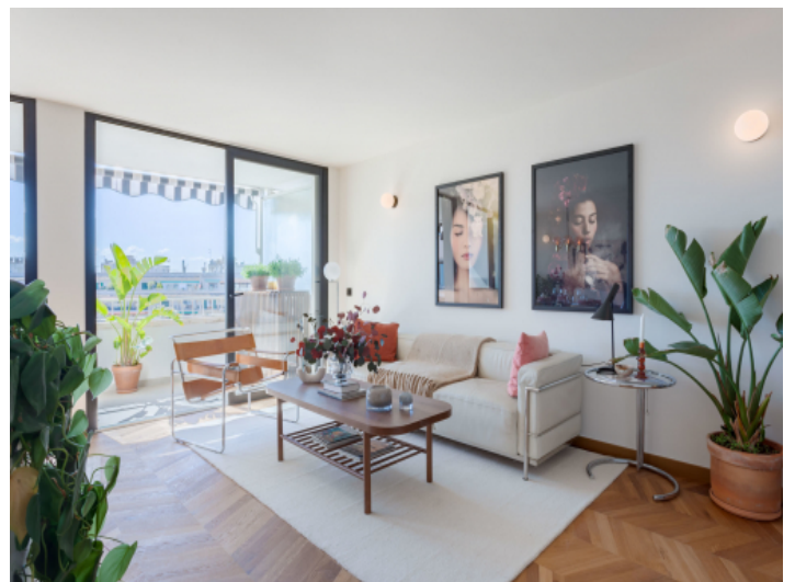
Living area with direct access to the terrace