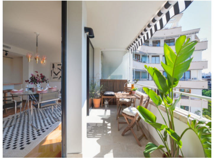
Mallorcan city lifestyle