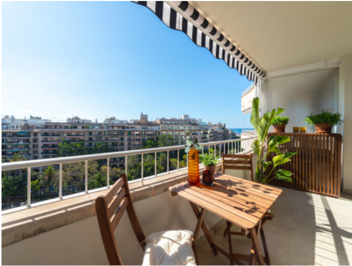
Partial sea view