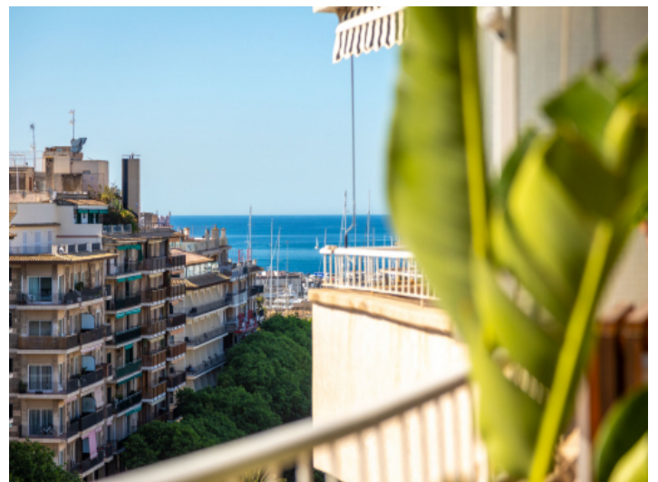
Views from the terrace