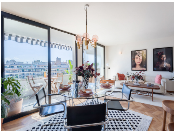
Elegant living area