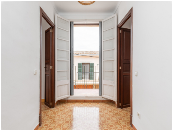
Hallway to the 2 bedrooms