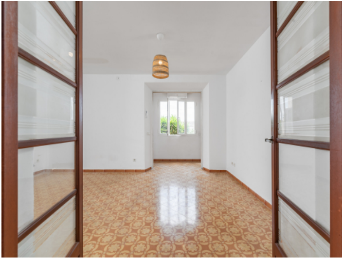
View to the living area