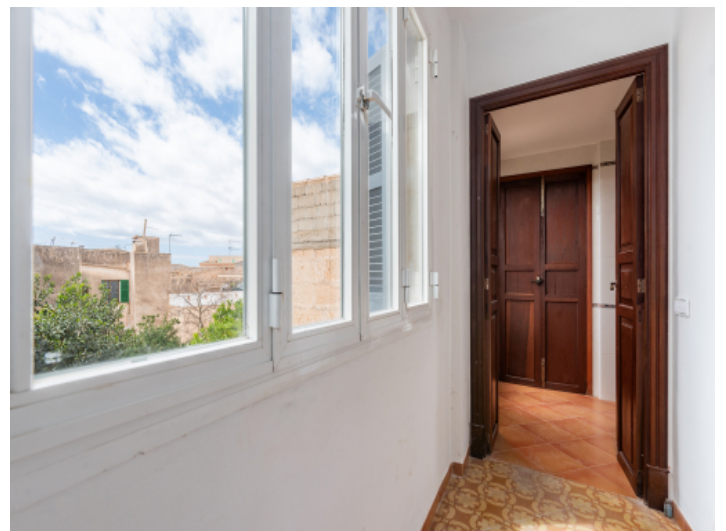
Hallway connecting kitchen, living area and bathroom