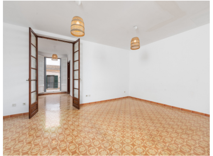
Large living area