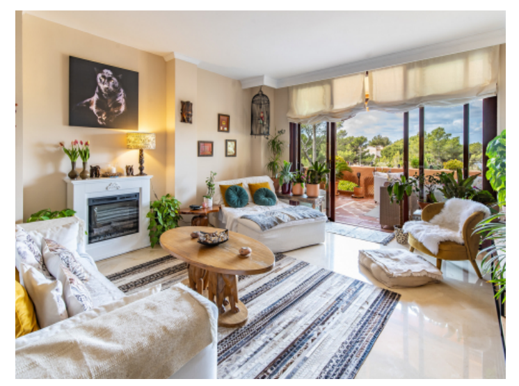
Terrace Living area