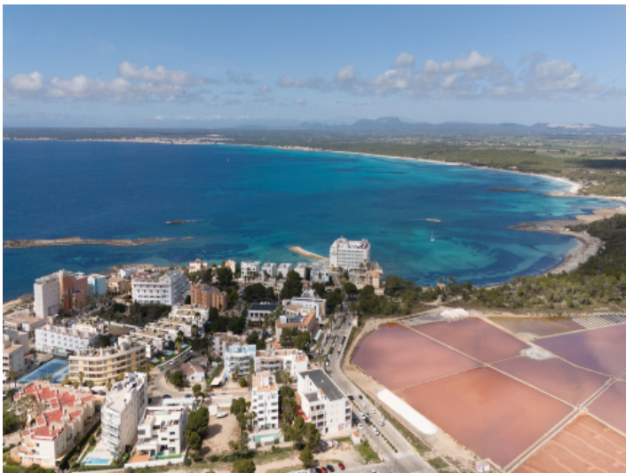
Colonia Sant Jordi