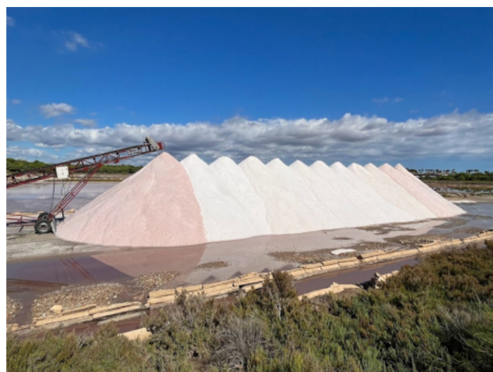
Es Trenc salt marshes