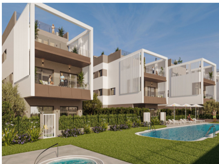
Facade and Community pool