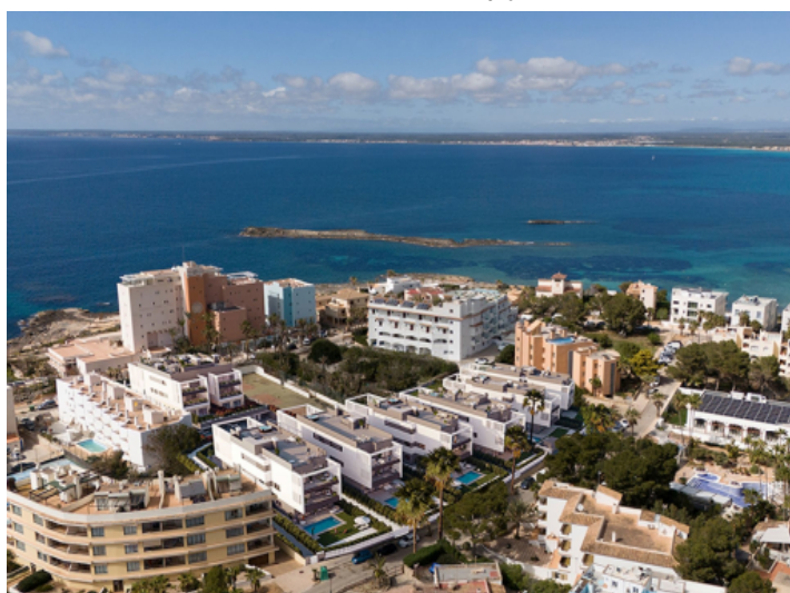
Nice village in the southeast