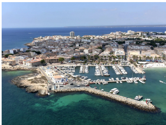
Harbour of Colonia Sant Jordi