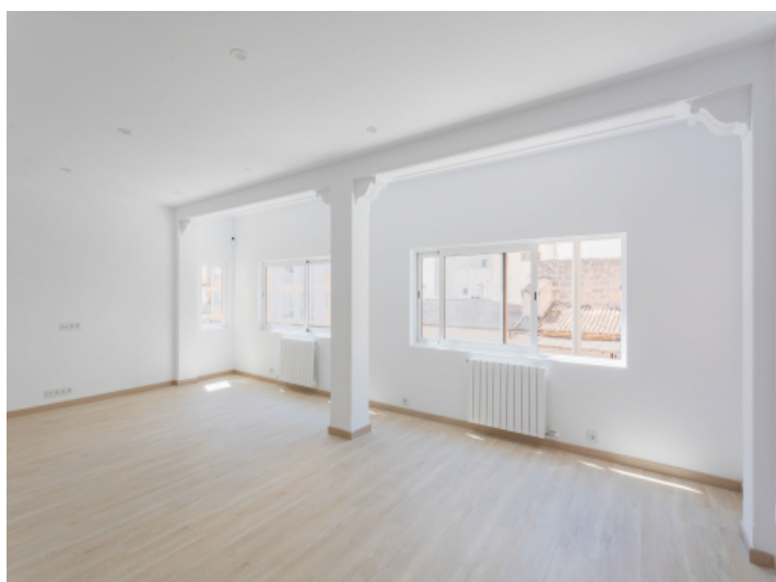
Bright, newly renovated apartment with large terrace to feel