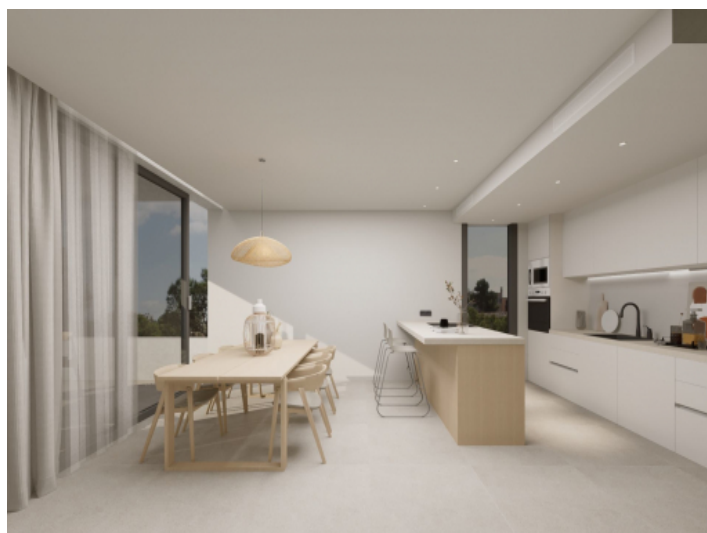
Open kitchen and dining area