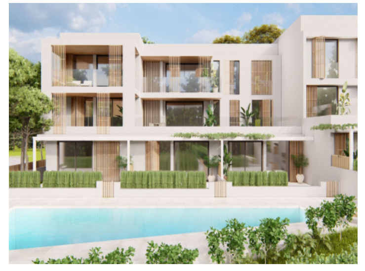
View to the complex