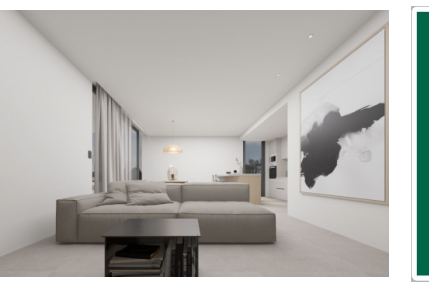
Porto Petro search for property MAL-121397