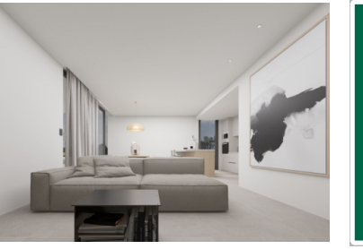
Porto Petro search for property MAL-121397