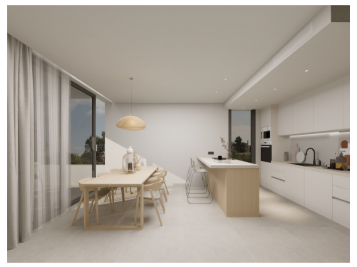
Kitchen and dining area