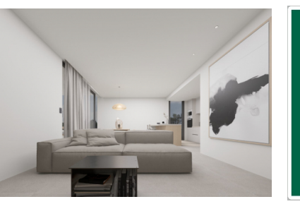
Porto Petro search for property MAL-121397