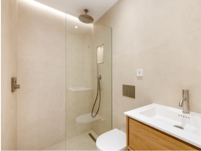
Bathroom with walk-in shower