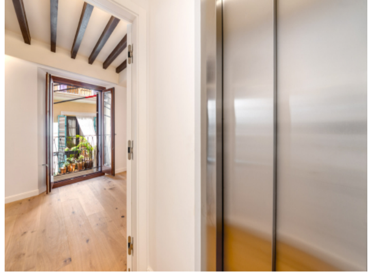
Direct elevator access