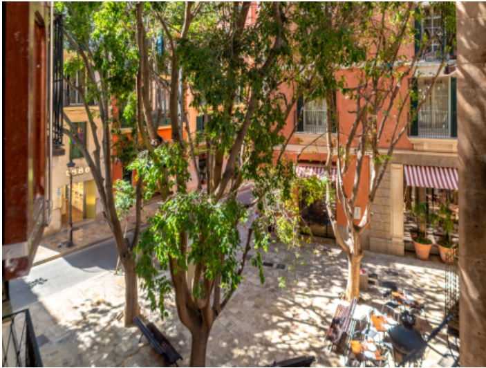
Views from the flat